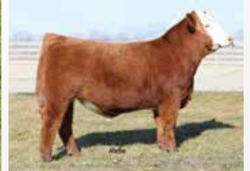
On The Mark x 034X