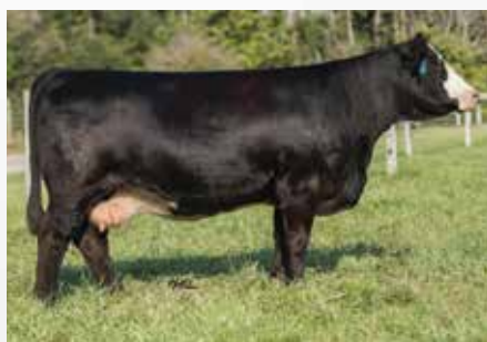
DANR Simply Irresistable