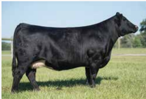
"Kitty" Full Sibling to Lot 50