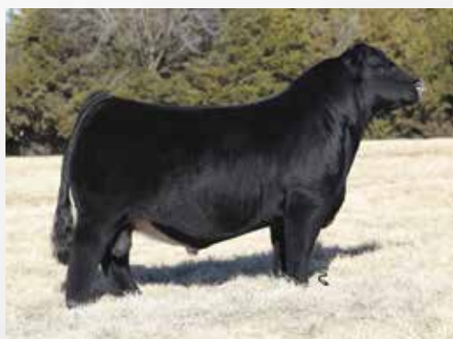
GEFF County O