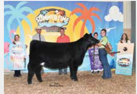
Maternal Sibling to Lot 2