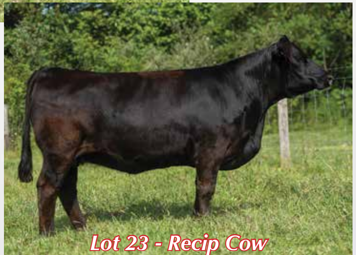
Lot 23 - Recip Cow