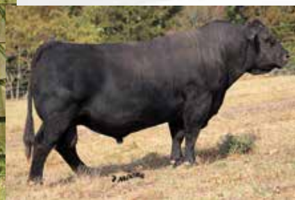
WHF Turned Up C006