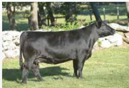
Ruby AJE Firefly Z227