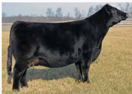
YNOT Glinda 3C