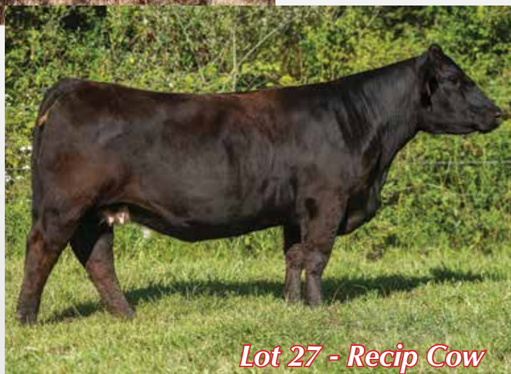
Lot 27 - Recip Cow