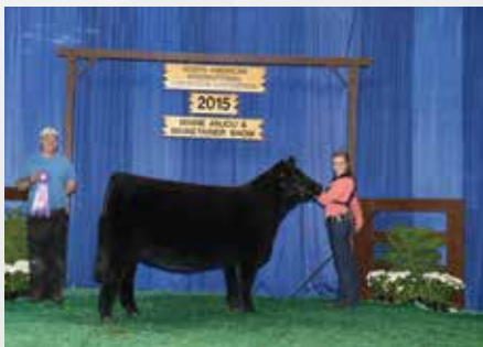
JSC So Sweet 158B