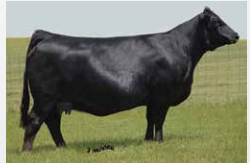
CMFM Dura Sara 040B