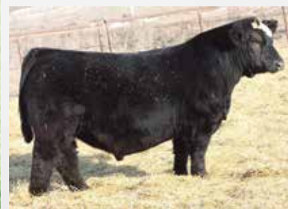
W/C Fort Knox