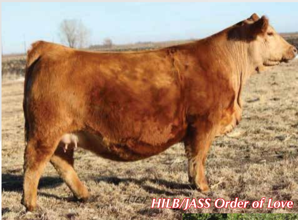
HILB/JASS Order of Love