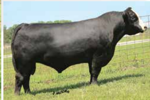
ES Destination DA29