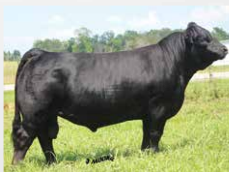
Horstman Reply All 898F