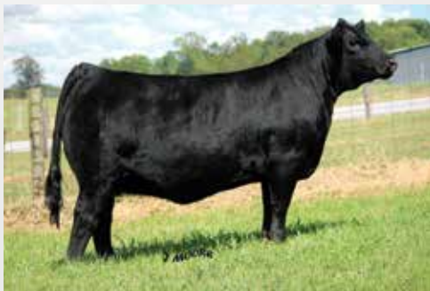
CMFM Pride & Joy 308D