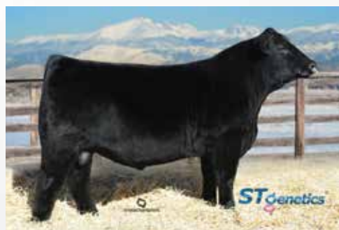
RFG/KLER Elevation 727E