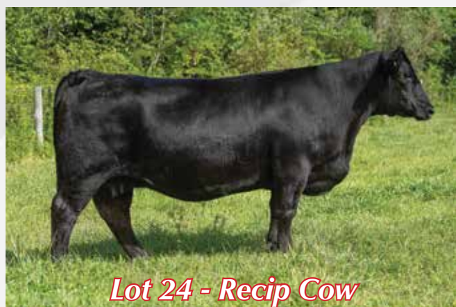
Lot 24 - Recip Cow