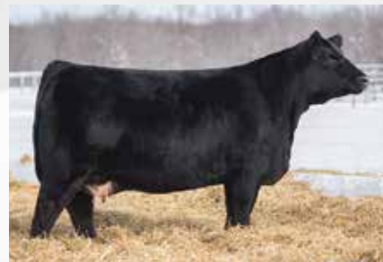
TNGLA Gemstone A527