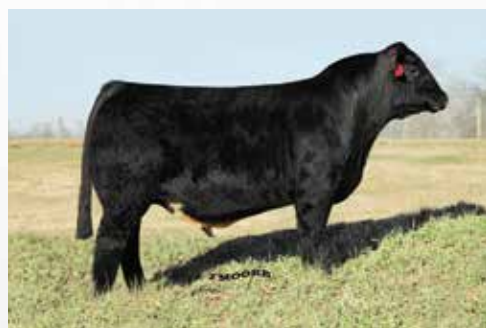
CCR Cowboy Poker 6313C