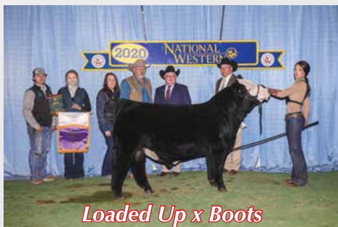
Loaded Up x Boots