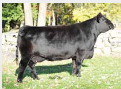
Myers Queen Sazerac