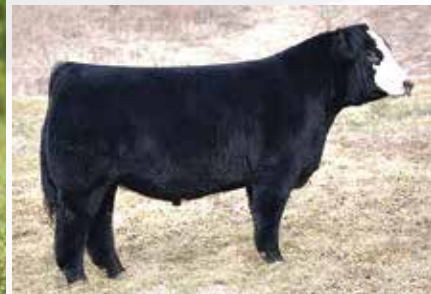
Hara's Distinction Maternal Sib to Lot 8