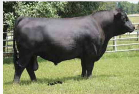
Hammer R&R 5166