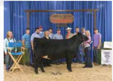
"Kitty" Full Sibling to Lot 50