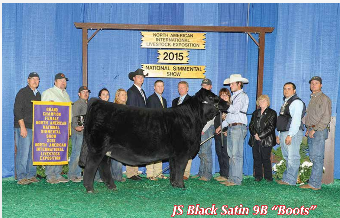
JS Black Satin 9B "Boots"