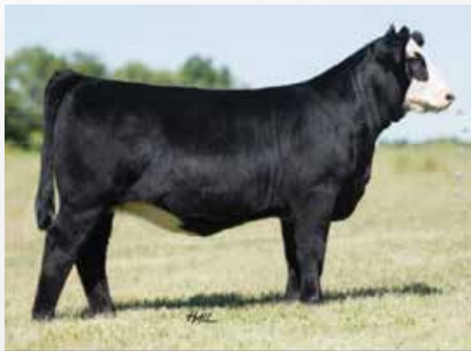
One Eyed Jack x 034X