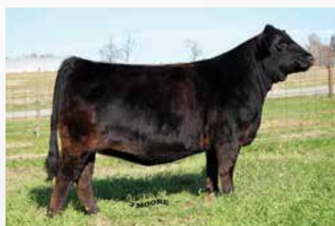
WHF Barbie 35B