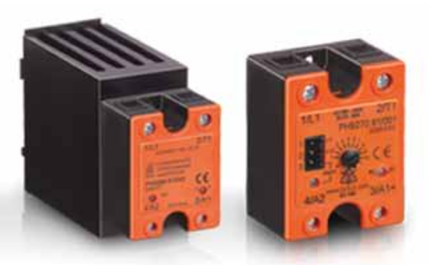
Power electronics > Page 15 - 18