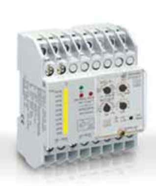
Monitoring devices > Page 11 - 14