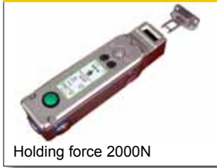
SOLENOID LOCKING INTERLOCK SAFETY SWITCH