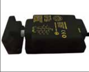
DEAD BOLTS WITH SAFETY MONITORING