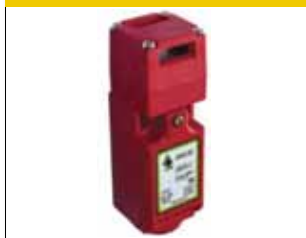
IDEAL FOR SLIDING HINGED OR LIFT-OFF GUARDS