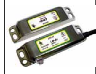
EXPLOSION PROOF NON CONTACT SAFETY SWITCH