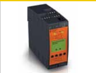
DOLD SPEED AND STAND-STILL MONITORS