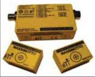
IN LINE NON-CONTACT SAFETY SWITCH FOR DOUBLE DOORS