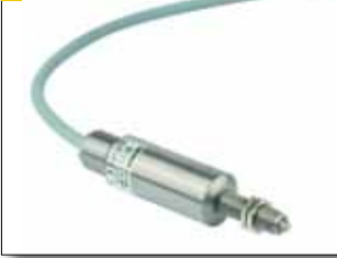
ROBUST STAINLESS STEEL SAFETY SWITCH – 2NC 1NO