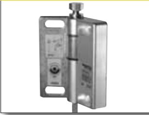
HEAVY DUTY AND ROBUST