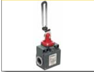
HINGE SAFETY SWITCH WITH DUAL CONDUIT ENTRY