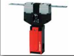
TWIN HEAD DESIGN – UP TO 4 CONTACTS