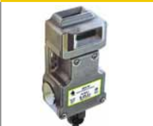
STAINLESS STEEL EXPLOSION PROOF INTERLOCK SWITCH