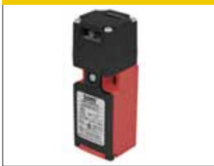
ECONOMY MODEL 1NO 1NC, 2NC, 3NC