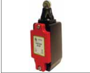
EXPLOSION PROOF DIE CAST LIMIT SWITCHES