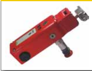
ROBUST DIE CAST BODY, REAR MANUAL RELEASE