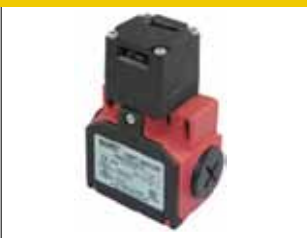
COMPACT BODY W/ CONDUIT ENTRY ON RIGHT/LEFT SIDE