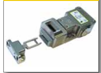
KEYED INTERLOCK SWITCH