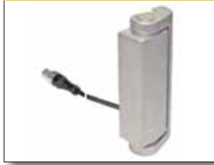
AVAILABLE IN 316L STAINLESS IP69K