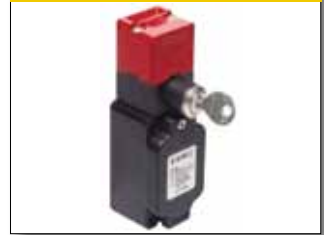
SAFETY SWITCHES WITH LOCK AND SEPARATE ACTUATOR