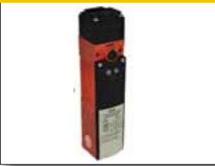
POWER TO LOCK AND UNLOCK 24VDC, 110VAC, AND 230VAC