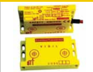
CAT 3 & 4 STAND ALONE SAFETY SWITCH