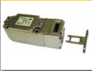
KEYED INTERLOCK SWITCH