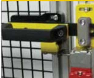
GATE BOLT TONGUE SWITCH ACTUATOR