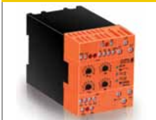
DOLD MOTOR BRAKE RELAYS