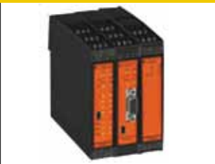
CONFIGURABLE SAFETY CONTROLLER SAFEMASTER PRO