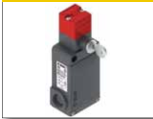
WITH/WITHOUT KEY OVERRIDE - COMPACT HOUSING