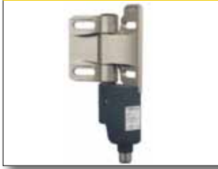
AVAILABLE WITH MULTIPLE CONTACT ARRANGEMENTS