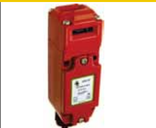
EXPLOSION PROOF INTERLOCK SWITCH