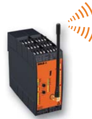
Radio controlled safety module UH 6900 Group controller