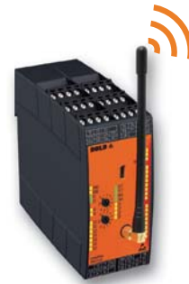
Radio controlled safety module UH 6900