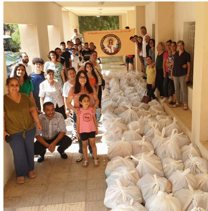
Food distribution in Koura and Tripoli

“ Each one must do as he has made up his mind, not reluctantly or under compulsion, for God loves a cheerful giver. And God is able to provide you with every blessing in abundance... (2Co 9:7-8 RSV)”