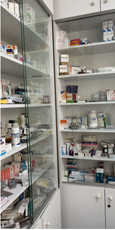
Medicine Distribution in Achrafieh, Beirut OYM Clinic