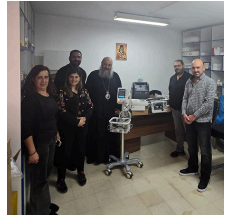
New Medical Equipment donated to St. Nektarios' Clinic in Qousaya