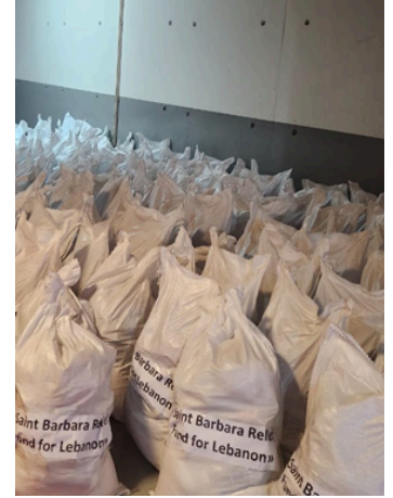
Bags of Food distributed in Zahle

“ Each one must do as he has made up his mind, not reluctantly or under compulsion, for God loves a cheerful giver. And God is able to provide you with every blessing in abundance... (2Co 9:7-8 RSV)”