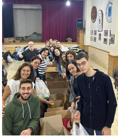
Orthodox Youth Movement packing meals for refugees of war