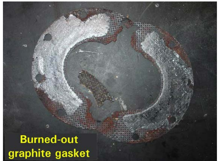
A gasket that failed the test cycle.