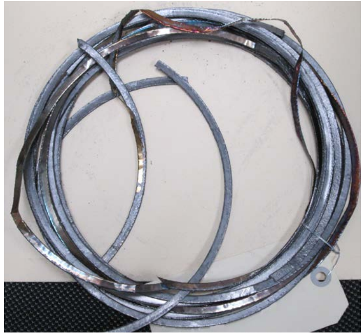
Multi-layer laminate featuring alternating layers of graphite & stainless steel – adhesively bonded.

It doesn't get much better than a >80% cost savings on a project with a material that works better than the original. If you have an application that you'd like our engineers to take a look at, contact us today!