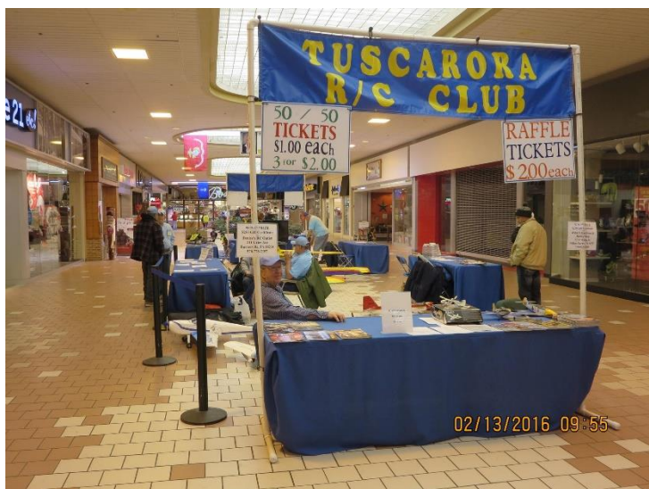
Schuykill Mall Show 2016

out with getting more people there in the hobby to show and talk to those who stop by that are interested in what its all about. There should be lots of planes, helicopters, possibly a turbine jet and a camera drone there as well. Hopefully we will have 2 RC simulators going to give the public a chance to feel what its like to fly an rc plane without going anywhere. Hope to see you all there for a great event.