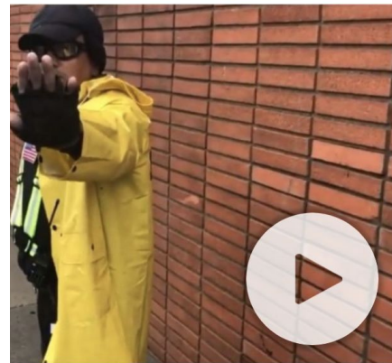
ot while live-streaming near LA synagogue;

The transgender YouTube personality who was shot outside a Los Angeles synagogue on Thursday is part of an online community that intentionally films law