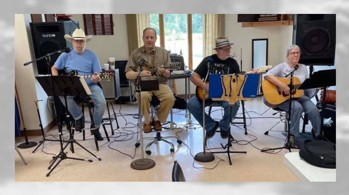
Come join us for some entertainment in our beautiful center!

We also have our monthly gift certificate drawings from the Bradford Area Chamber of Commerce sponsored by the Bradford Elf Fund organization.