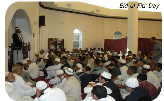
Eid ul Fitr Day