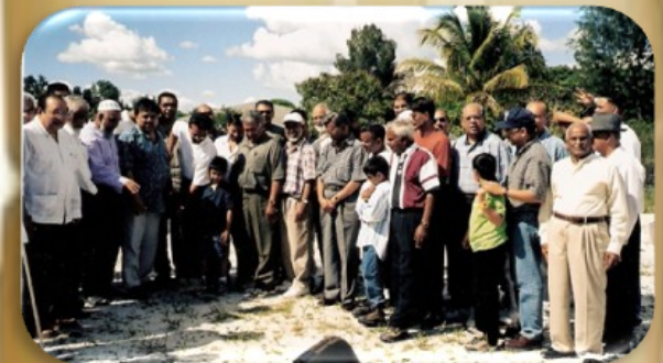
Ground Breaking, May 2000

The City of Pembroke Pines approved the Site Plan for the Mosque in May 2000. Thereafter, construction began with the approval of the architectural drawings and collection of start up funds. The members, motivated by their strong faith, gave generously and consistently contributed their time, effort and monies toward the full payment of the land and to finance construction of this beautiful Mosque. All funds were raised locally supplemented by interest free loans obtained from a few members. Most of the loans have already been repaid, Alhamdu Lillaah!