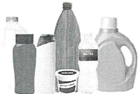
Plastic Bottles, Jugs, Tub, & Lids (Empty kitchen, laundry, & bath containers)