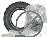
WOOD, WASTE, OR TIRES