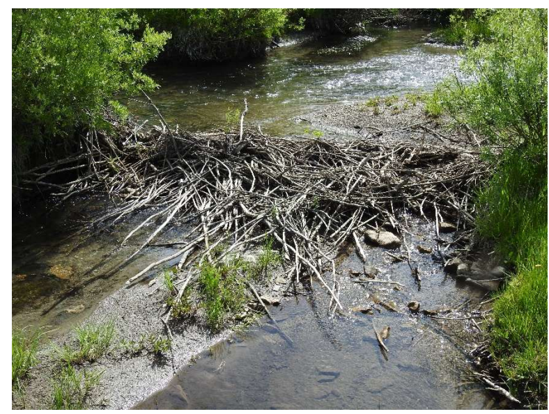
Figure 9: Inactive dam in Zone XLII, XLIII