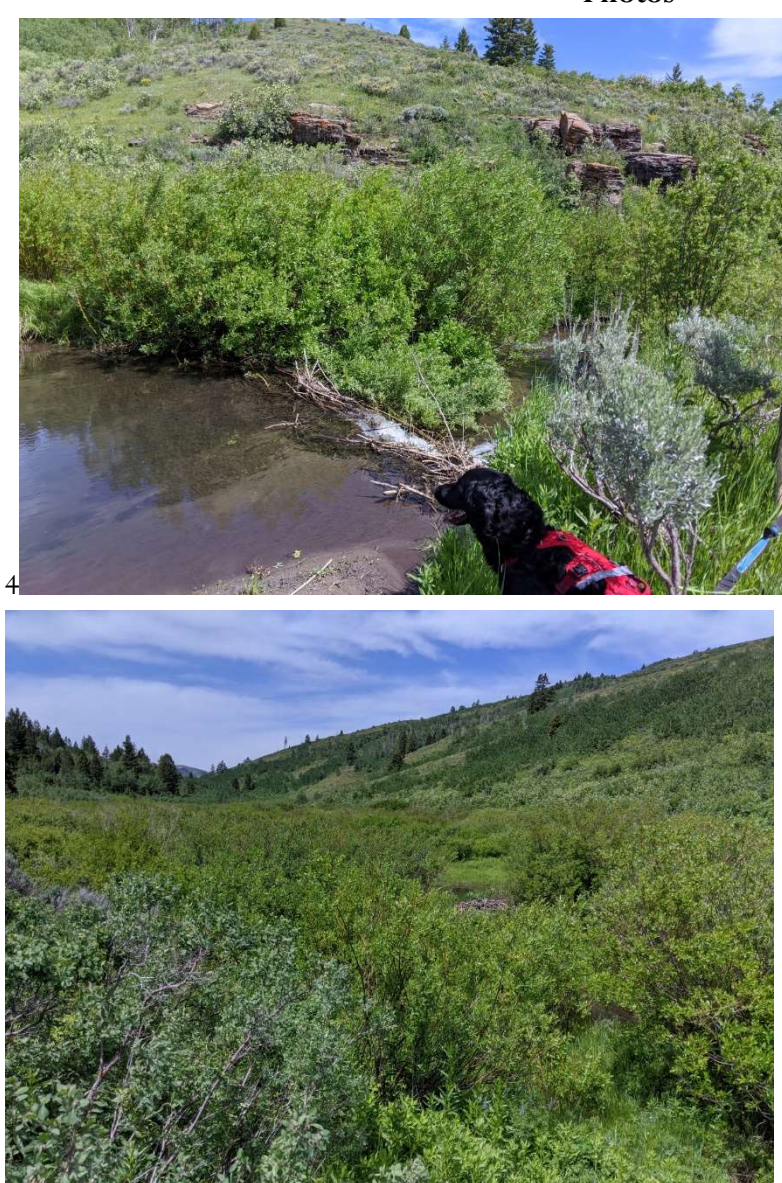
Figure 3: Inactive dam near the start of zone XLIV