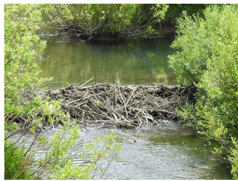
Figure 15: Inactive dam in Zone XLII, XLIII