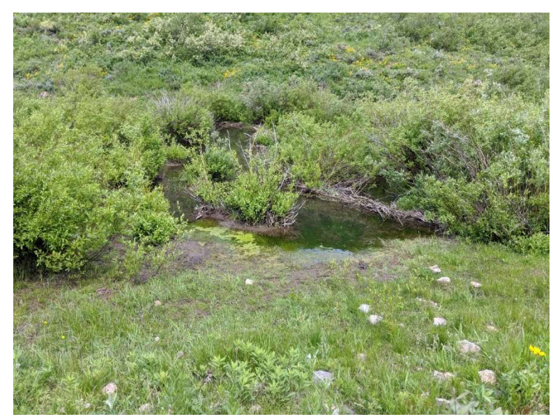
Figure 5: Inactive dam on Zone XLIV