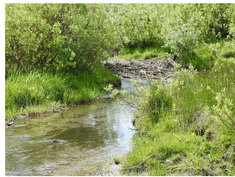
Figure 7: Inactive dam in Zone XLII, XLIII