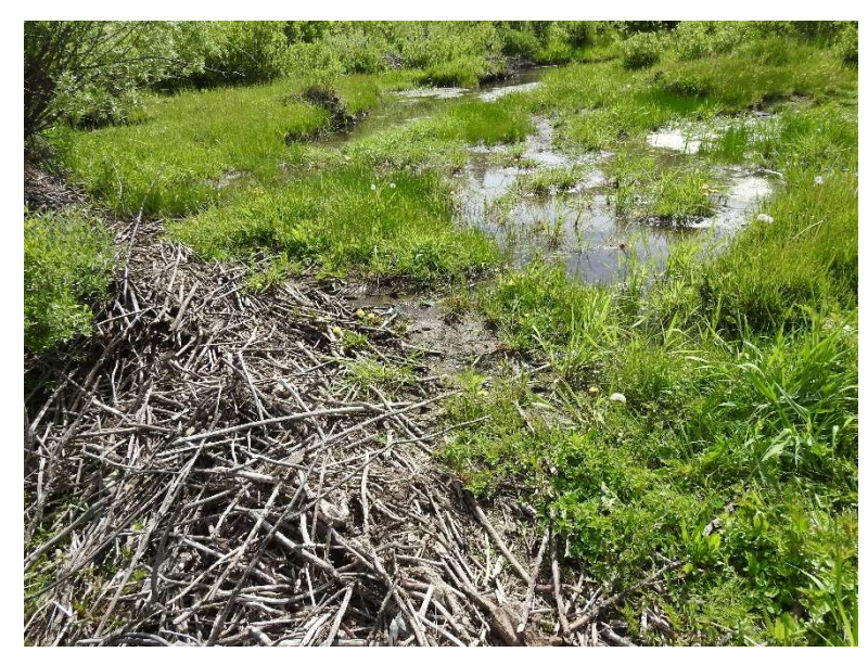
Figure 19: Inactive dam in Zone XLII, XLIII