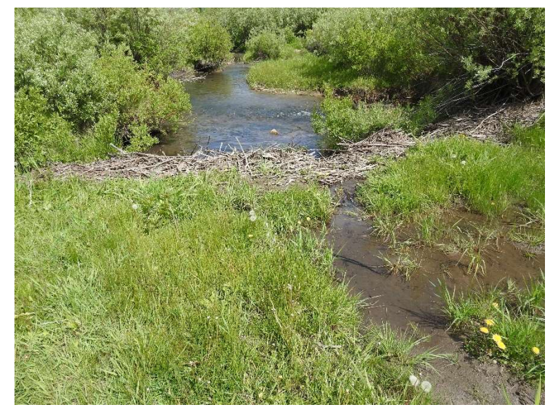
Figure 18: Inactive dam in Zone XLII, XLIII