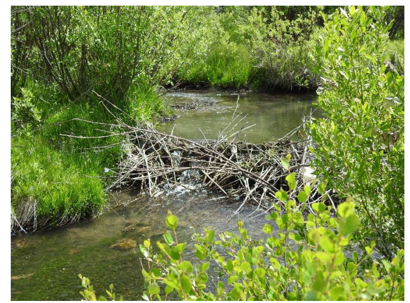
Figure 16: Inactive dam in Zone XLII, XLIII