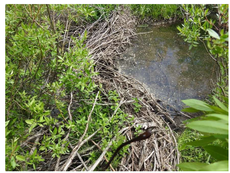
Figure 17: Inactive dam in Zone XLII, XLIII