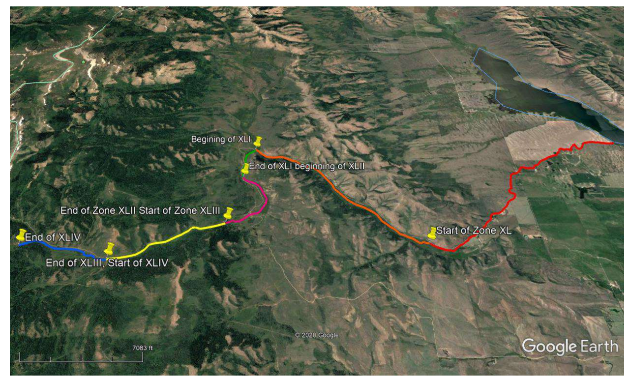
Figure 2: Approximate locations of the Toponce Zones

Zone boundaries were marked by flagging or other recognizable evidence that was discussed prior to commencing the census. Figure