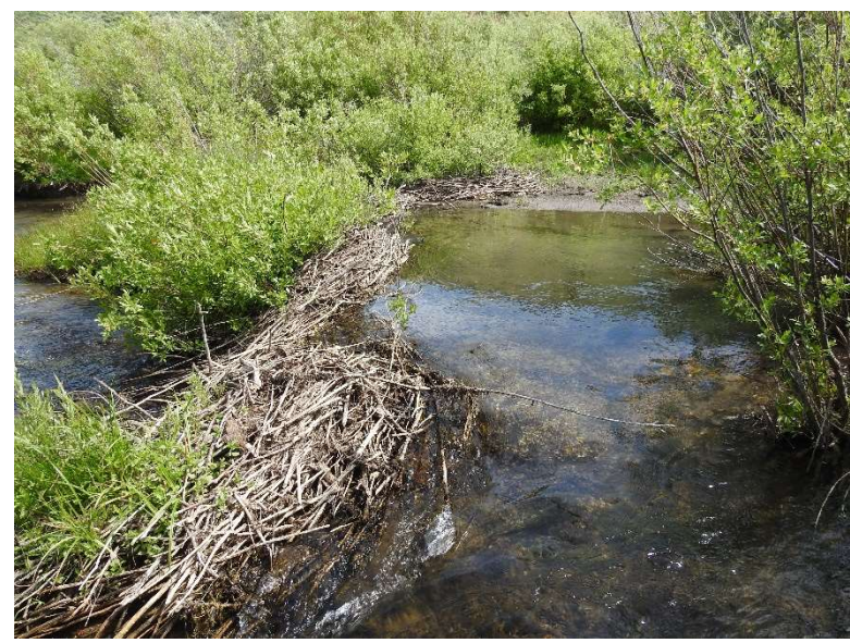
Figure 13: Inactive dam in Zone XLII, XLIII