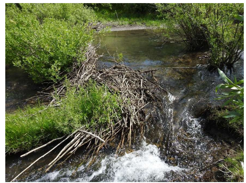
Figure 12: Inactive dam in Zone XLII, XLIII