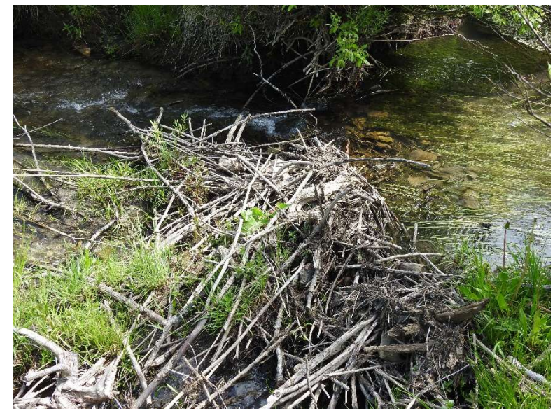
Figure 20: Inactive dam in Zone XLII, XLIII