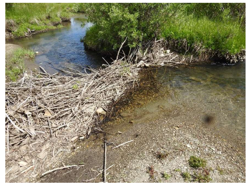
Figure 10: Inactive dam in Zone XLII, XLIII