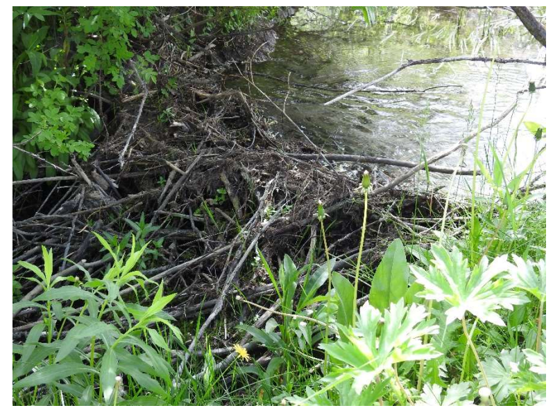
Figure 14: Inactive dam in Zone XLII, XLIII