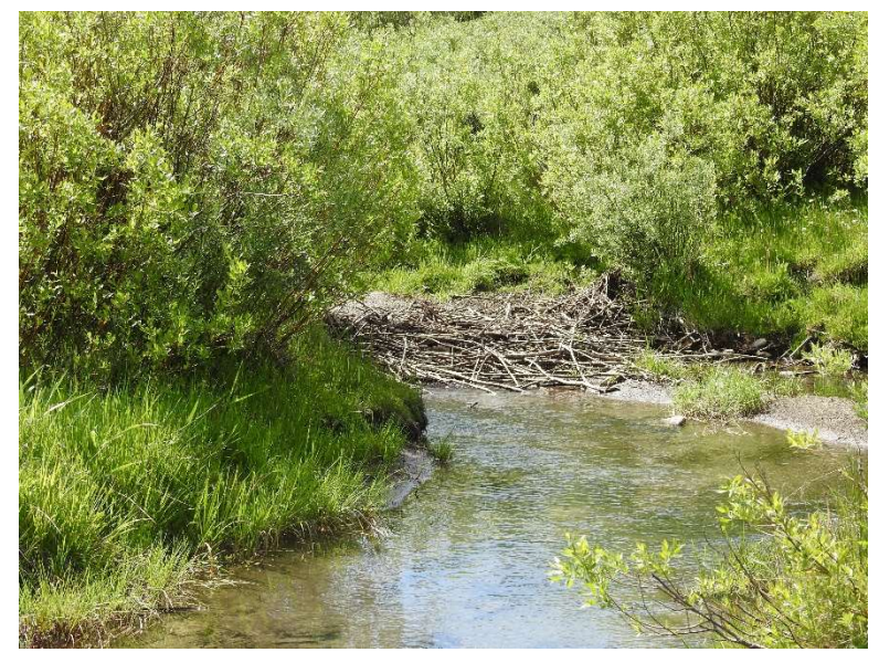
Figure 8: Inactive dam in Zone XLII, XLIII