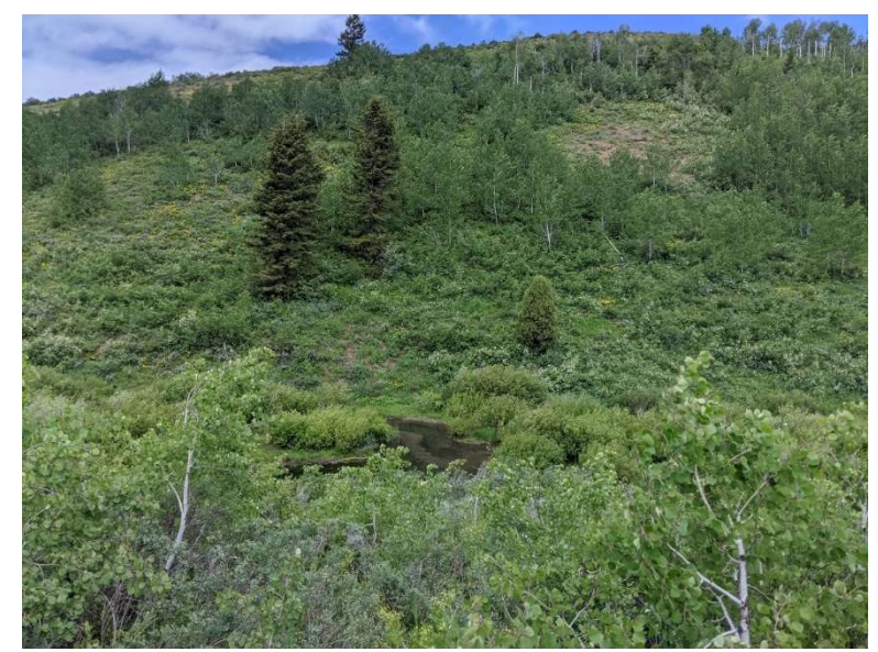
Figure 4: Stream scouring below blown dams, zone XLIV