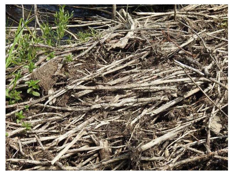
Figure 11: Inactive dam in Zone XLII, XLIII