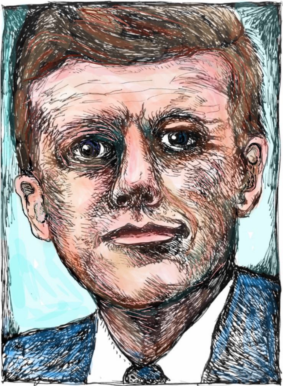
This is President John Kennedy.