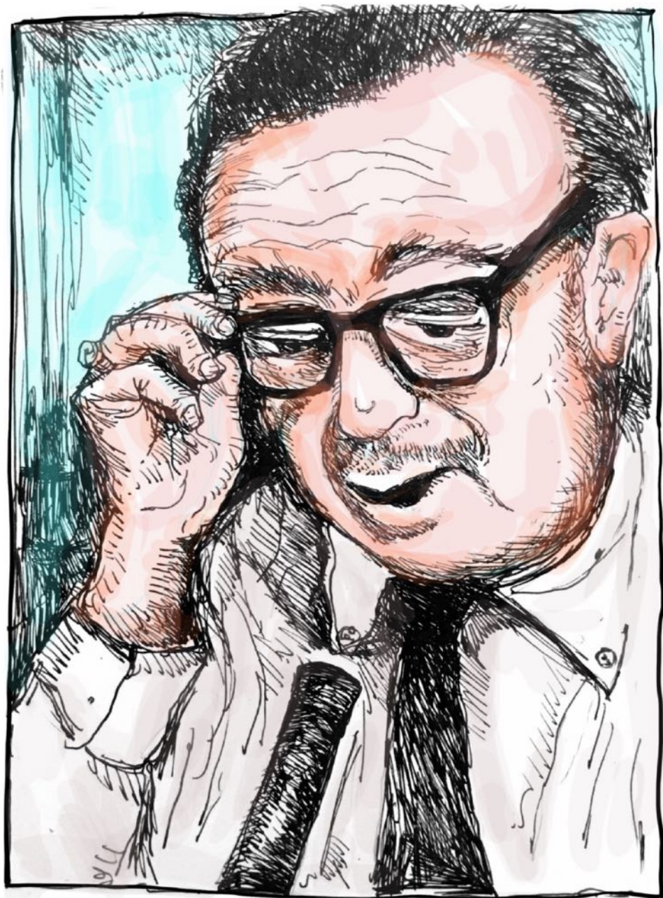
This is CBS newsman Walter Cronkite, he was the most trusted man in America.