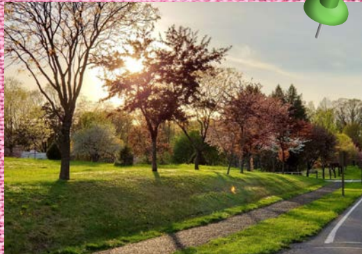
Spring sunset near Ridge Campground