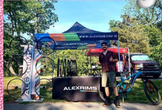
A vendor at our first annual Raystown Bike Fest!