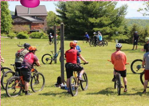
Coaches receiving training at the PICL Coaches Retreat