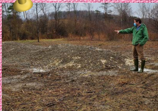
Professor Roy Nagle showing off the new turtle nesting mounds at Fouse's Crossing