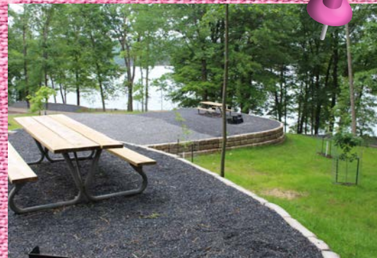
Improvements in Susquhannock Campground are ready to go for the summer season!