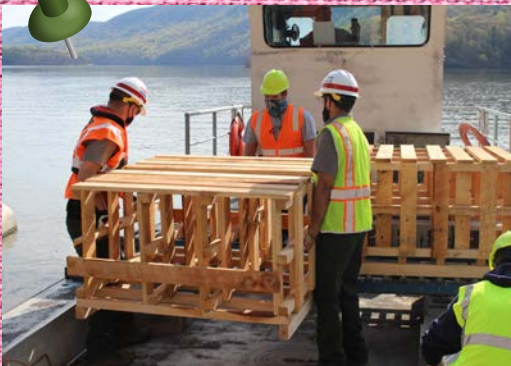
Participants at Fish Structure Building Day in April