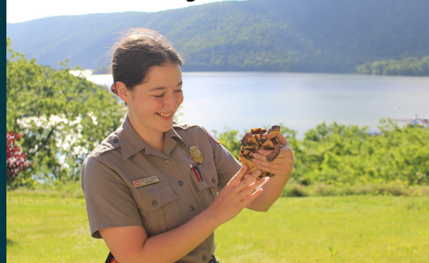
A map turtle using the new nesting mounds