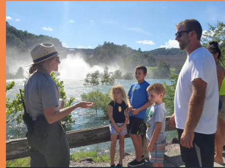
Rangers took advantage of the opportunity to teach visitors about USACE's flood risk management mission at Raystown Lake.

On Friday, Sept 3, the spillway reopened and began releasing approximately 13,000 cubic feet of water per second. At this rate, the lake receded by about 2 feet per day. Facilities reopened by Friday, Sept 10 after USACE ranger and maintenance staff reinstalled courtesy docks, removed debris from launch ramps, reconnected utility amenities, and performed other safety inspections.