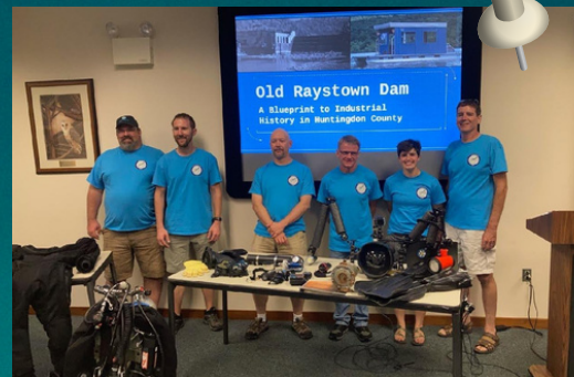
A group of local SCUBA divers discuss the old Raystown Dam and recount their diving experiences.