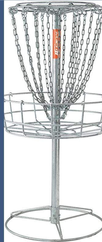
Disc golf basket