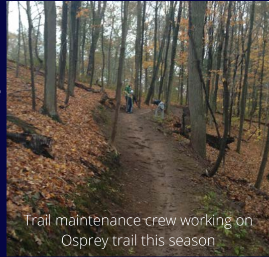
Trail maintenance crew working on Osprey trail this season

Things are quiet at the Allegrippis trails. Snow cover has kept all but the heartiest souls away. That's about to change though. Several events are in the works, making for an exciting year. The first event coming up is Raystown Bike Fest. Originally planned for last May, COVID necessitated delaying the premier edition of this event to May 21-23, 2021. To comply with COVID restrictions, the event will look a little different than Dirt Fests of old. Bike Fest will be a fun campout weekend centered around biking with your "pod".