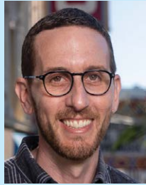
State Senate, District 11 SCOTT WIENER*