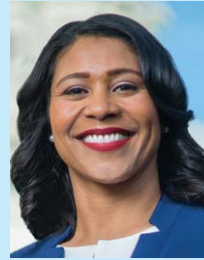
Mayor LONDON BREED*