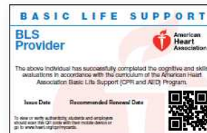
AHA eCards (certificate and wallet size)