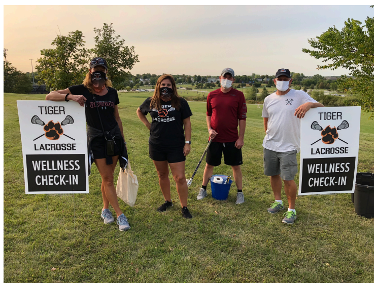
West Des Moines officials welcome players to fall ball check-in with a return to play protocol.

Response to the pandemic — With the help of USA Lacrosse (USAL) and the West Des Moines Lacrosse Club, the Association developed a COVID19 response protocol for member clubs to use for future lacrosse activities going forward. From the large volume of USAL return to play guidance and recommendations, ILAX worked with West Des Moines to create a COVID19 Action Plan (CAP) template that incorporated the most important recommendations for clubs to use as they wrestled with the situation. West Des Moines' input helped ILAX find that balance between what was reasonably safe but yet practical.