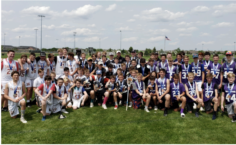
Place-winning U14 teams at the Iowa Games in Ankeny in 2019

can take part in the league. ILAX extends a big “thank you” to the participating clubs and their volunteers for making the Boys league happen under challenging circumstances.