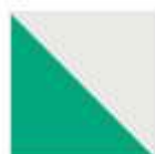
Half Square Triangles

15 Half Square Triangles 2.5” unfinished (or 4 Flying Geese 4.5 x 2.5” and 11 Half Square Triangles)