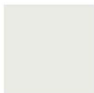
1 Patch Block A Total 19

For 16 use 4 Light and 4 Dark Fabric Squares at 4” (these are extra stretchy so be careful how you handle, or starch before making to help prevent)