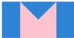
Block E Total: 6

These will be joined with Block G & H so colour placement is important. Unfinished size 8.5 x 4.5"