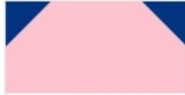
Block D Total: 6