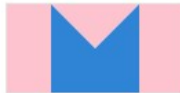
Block F Total: 6