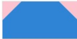
Block H Total: 6