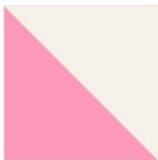
HST Total: 12

9 Blocks equal a quilt size approx. 48x42" without borders