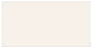
background Total: 4

Trimmed to 2.5" square, using background and a high contrast fabric.