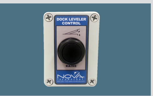
Push-button operation for smooth, consistent operation with a hydraulic system that provides for full float at all positions.