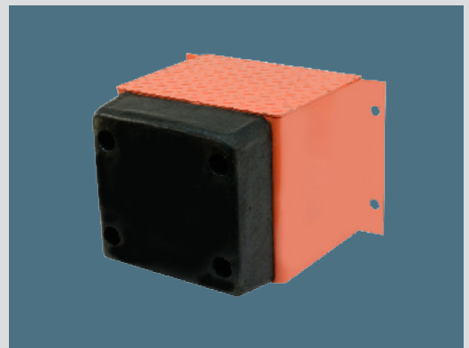
Heavy duty bumper blocks