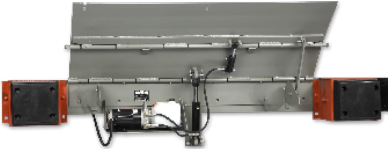
*Mechanical edge-of-dock leveler shown with heavy duty bumpers

When dock space is limited or the working range of a full size, pit-style leveler is not needed; NOVA's edge-of-dock levelers are an economical option. Edge-of-dock levelers mount to the dock face and provide a working range of 5 inches above and 5 inches below dock.