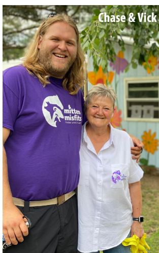
Chase &amp; Vick