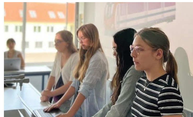
THEME: Civic Amenities St. George British International School, Germany