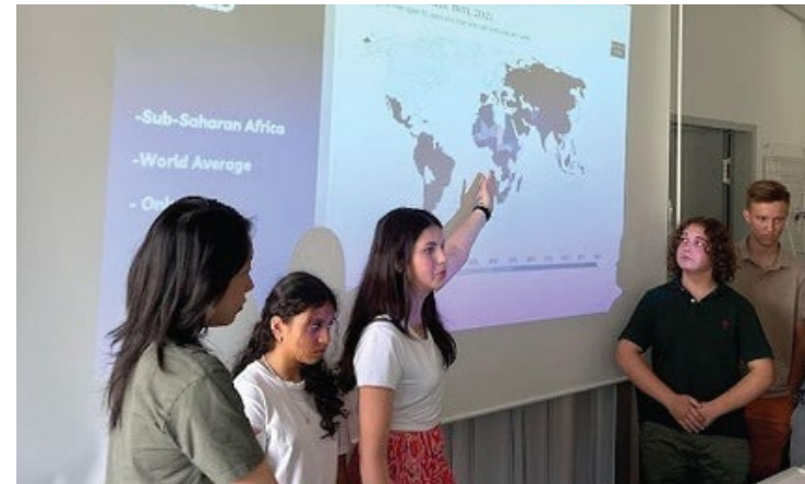
THEME: Education & Society St. George British International School, Germany