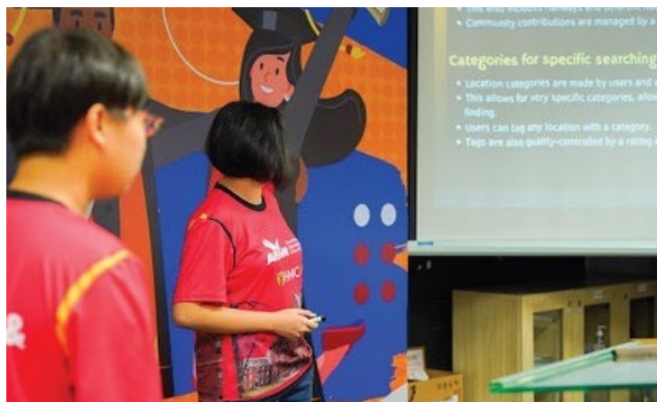
THEME: Technology & Society American International School of Vietnam