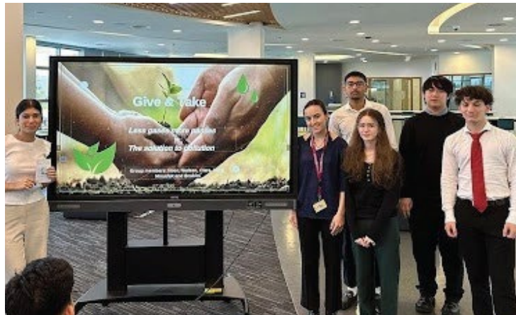
THEME: Environment & Technology GEMS Wellington Academy, Dubai, UAE