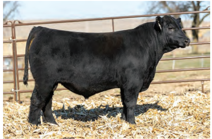
CCA GROWTH FUND H10. Service Sire of lots 51-55.