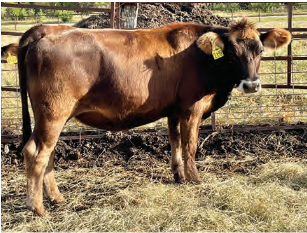
Lot 54 - Commercial Heifer BBB 2148