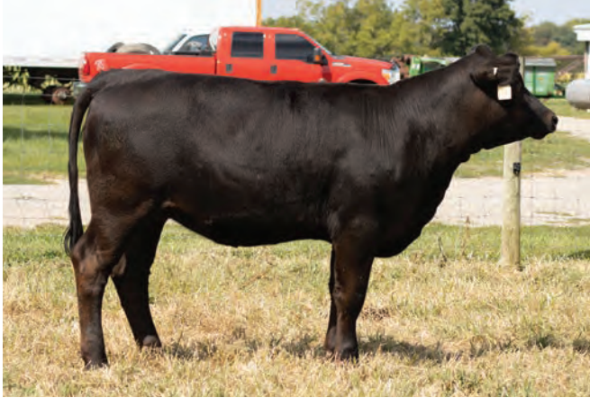
Lot 31- MS RDF CHEYENNE 1197J