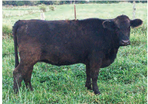
Lot 47- LLL SWEET CONVERSATION

4 L CATTLE CO Chad Lueking 2112 Bannister Rd., Salem, IL 62881 (618) 267-6610 Chad_Lueking@nal.com Lots 45-47