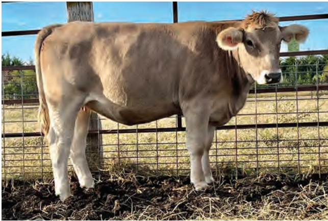
Lot 51- MISS BBB 2138

BIG BLUE BRAUNVIEH Jeff and Jason Zimmerman 6370 W Hackberry Rd, DeWitt, NE 68341 Jeff (402) 223-8367 • Jason (402) 520-0605 Lots 51-55