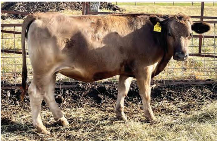
Lot 55- Commercial Heifer BBB 2136