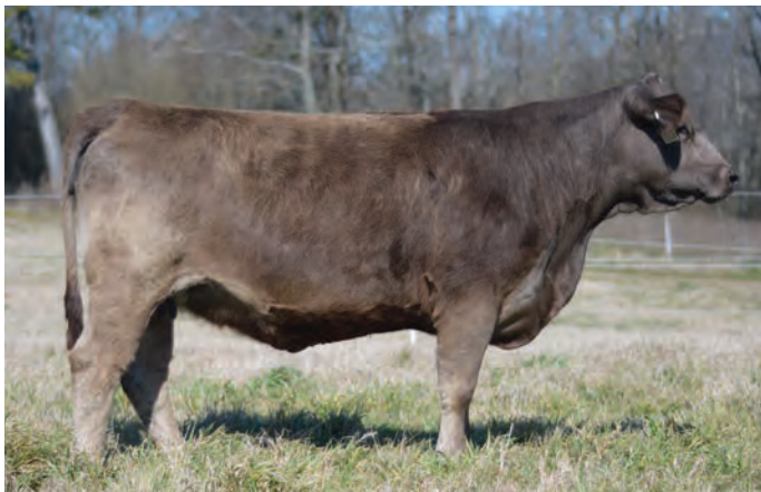
WW Gypsy Rose 813F. 3/4 Sister to lot 30.