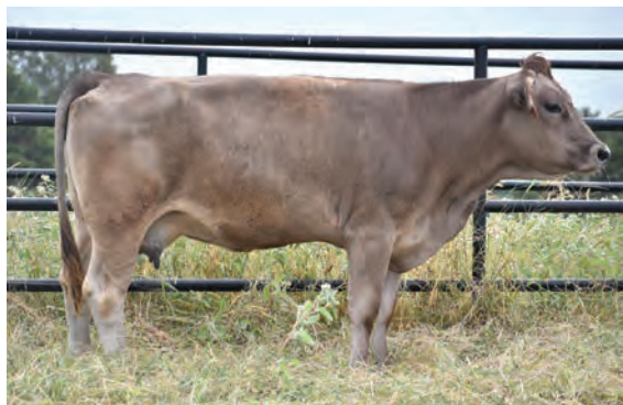
Lot 42- LLR LORIE1