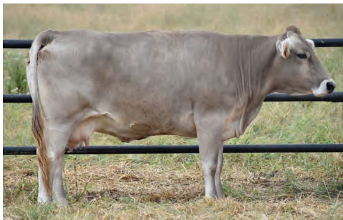
Lot 43- BRD TINA A86