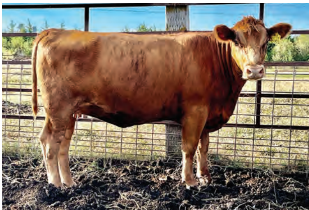
Lot 53- Commercial Heifer BBB J003

Big Blue 52 WCCR HAZEL 1410 Spring Calving Purebred Heifer PB104120 Calved 3/23/2021 Tattoo WCCR 1410