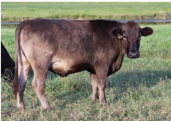
Lot 26- C FARMS MISS 0309

This great producing daughter of MHF Pure Country has done a fantastic job at our place. She's one that anyone that goes through our herd notices her mostly by her beautiful udder, body condition, and that moderate frame. Pure Country was born to make females, and her dam stems from some the best cows I've owned. Time for someone else to take her home and have a BLC Warlock 470D calf next spring. Pasture exposed to BLC Warlock 470D (PB90070) 6/18/2022 to 8/20/2022. She's confirmed pregnant for a spring calf to BLC Warlock 470D. Warlock is in the top 1% CED, 3% BW, 40% Weaning, and 35% Yrlg. With an API at 144.54. Hard to beat that.