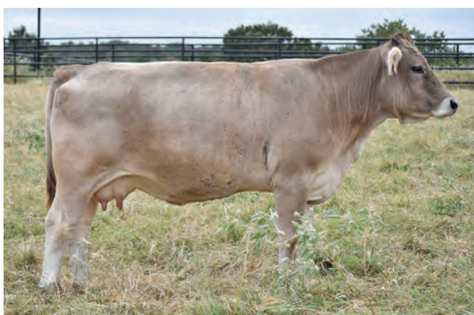
Lot 44- RBB MISS MARSHA