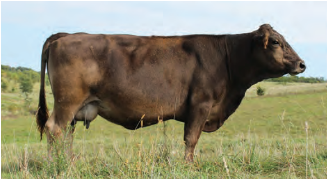
Lot 27- C FARMS MISS 3612