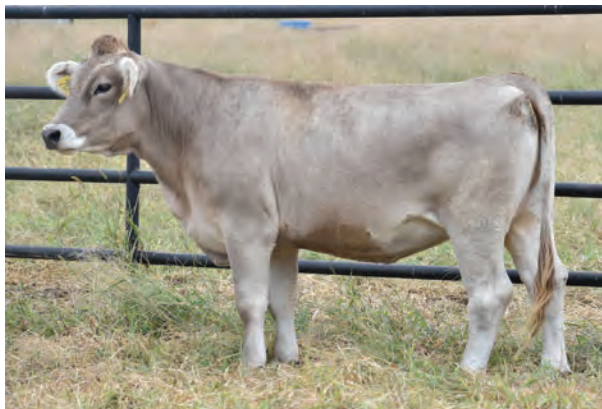
Lot 48- BRD MS G277