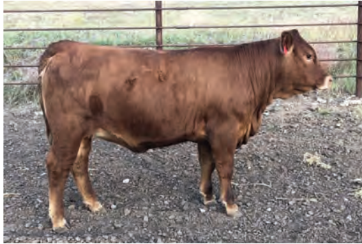
Lot 15- MISS SFF 151J