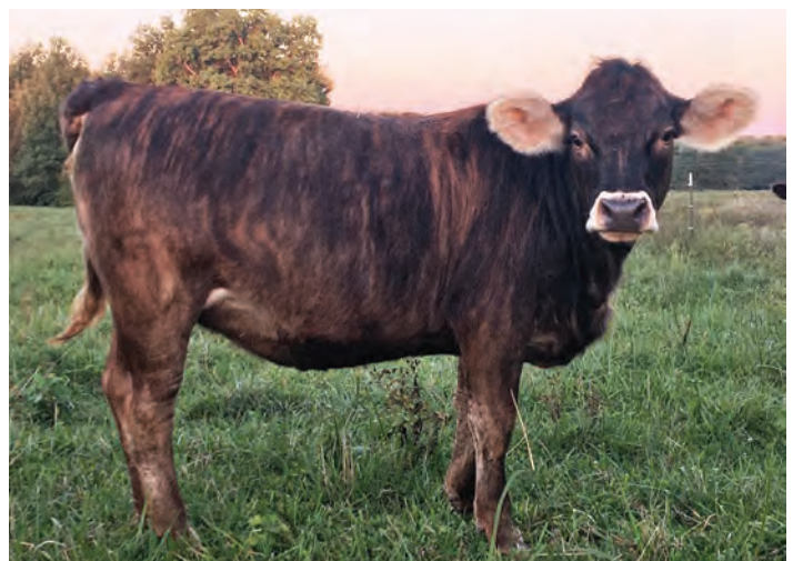
Lot 46- MISS RCB J166

• This March yearling is out of a WDL's Polled Apollo daughter and sired by an Angus bull. • Pasture exposed 7/1/2022 to sale day to BLC Hefty 101H, a Toronto son. Will be preg checked before the sale.