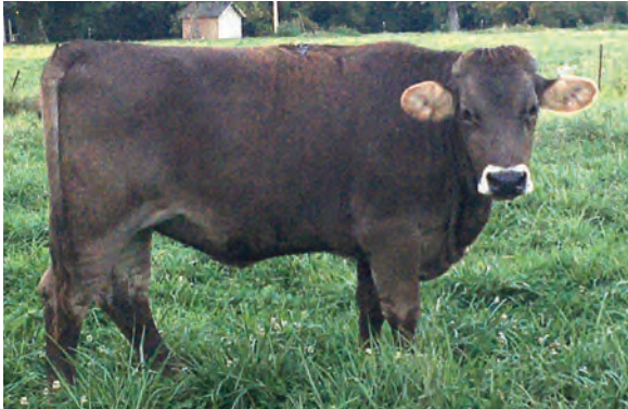
Lot 45- LLL MAY 304