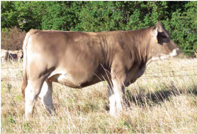
Lot 21- BLC AURORA LIGHTS 808J