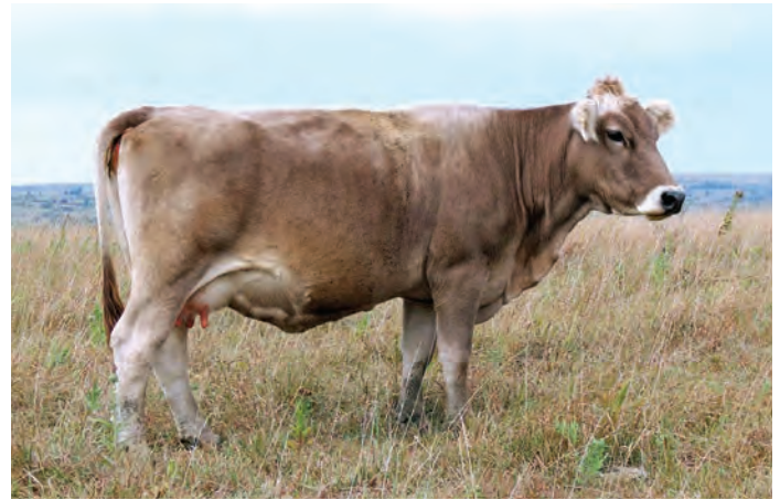
Lot 23- BLC DOROTHY 012E