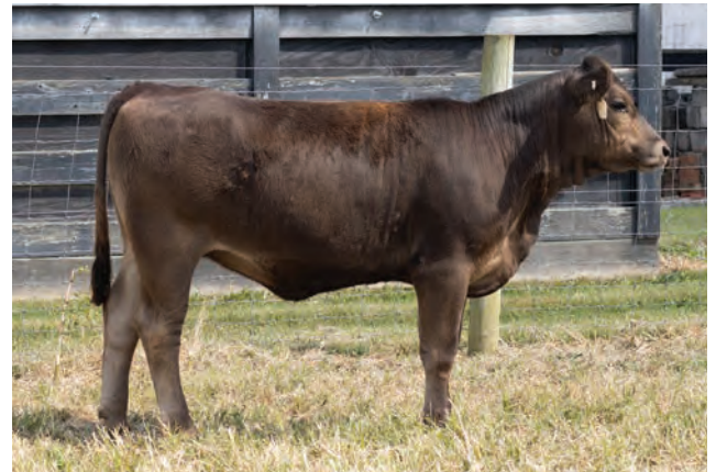
Lot 32- MS RDF MYSTIC TREAT 1203J