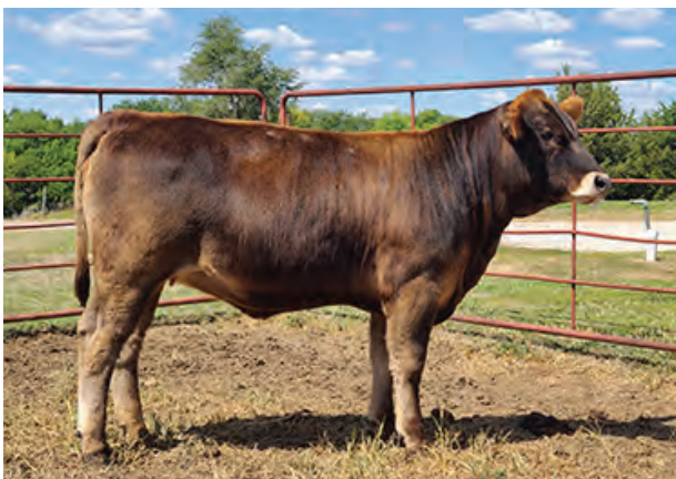
Lot 17- MISS RH J116