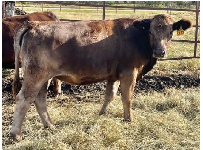
Lot 52- WCCR HAZEL 1410

Big Blue 51 MISS BBB 2138 Spring Calving Purebred Heifer PB103244 Calved 4/1/2021 Tattoo BBB H138