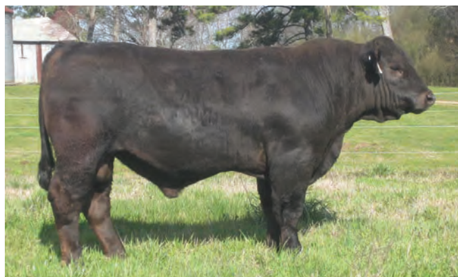
WW XEROX 861F Reference Sire A

• Preg checked by a vet on 9/20/2022. She was confirmed 75 days pregnant to OCC Mr Bojangles 152D ET (PB90312).