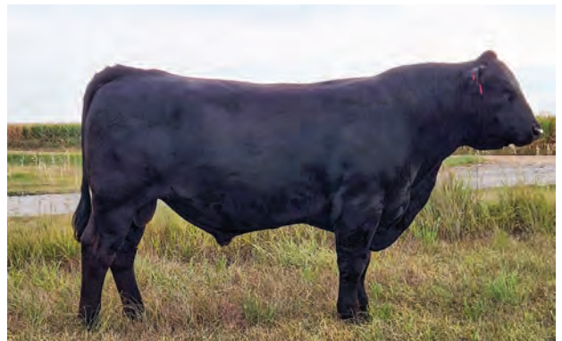
SFF MR. AMMO 123J Service Sire of Lot 16