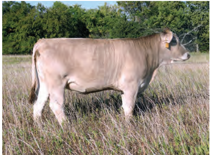
Lot 19- BLC AURORA 684J