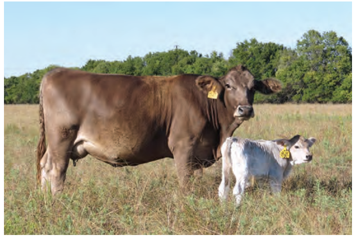
Lot 20- BLC COURTNEY 668G & BC