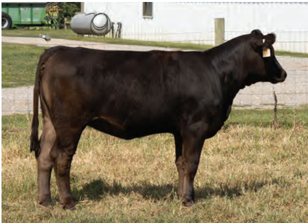
Lot 33- MS RDF MYSTIC TREAT 1202J

• When we decided to sell some of our open heifer replacements we decided to pick from the top. Cheyenne's pedigree is full of well-known genetics including MHF Xerox X002, MHF W9161, AAA Woodrings Powerstar, and WW Flagstaff 604D. 1197J is dark in color and out of one of our Flagstaff daughters. Our Flagstaff daughters have proven to be great females.