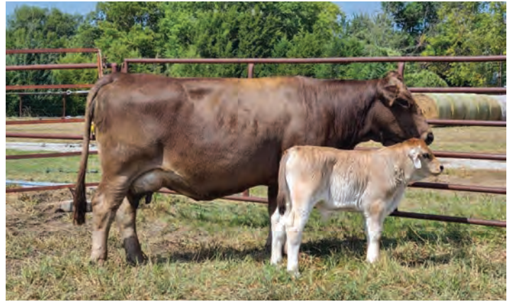
Lot 8- MISS RCB B454 & Bull Calf