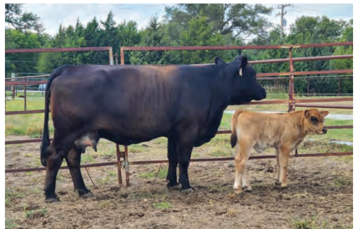
Lot 7- MISS RCB D658 & Heifer Calf