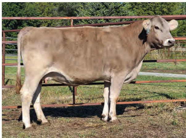
Lot 50- MISS JANA G81

• Preg checked 9/8/22, confirmed 40 days bred to MCB TEB 8018 7421 (OB93854), due to calve May 2023.