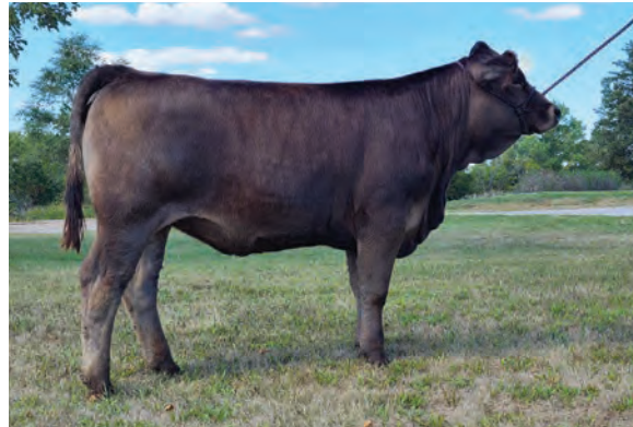
Lot 5- MISS RCB J164