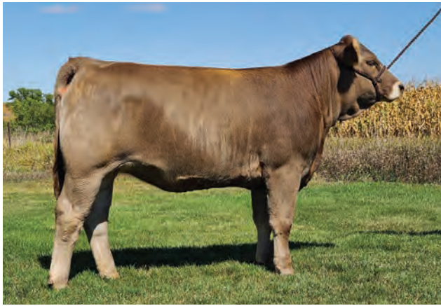
Lot 6- MISS RCB J162