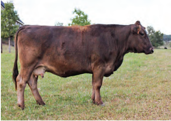
Lot 24- C FARMS MISS 2269