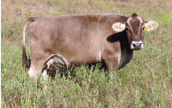
Lot 18- BLC URSA 668F