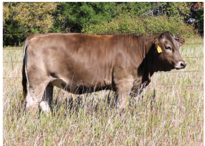
Lot 22- BLC AURORA 287J