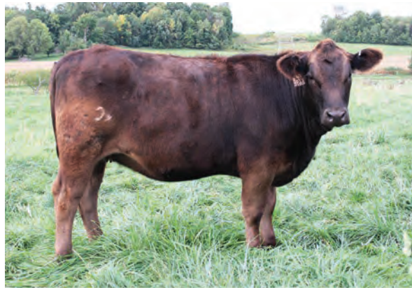
Lot 25- C FARMS MISS 1669