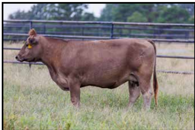
Lot 38 - WW MS 986G BP