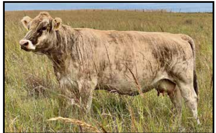
Lot 55 - WCCR CORNERSTONE 5001