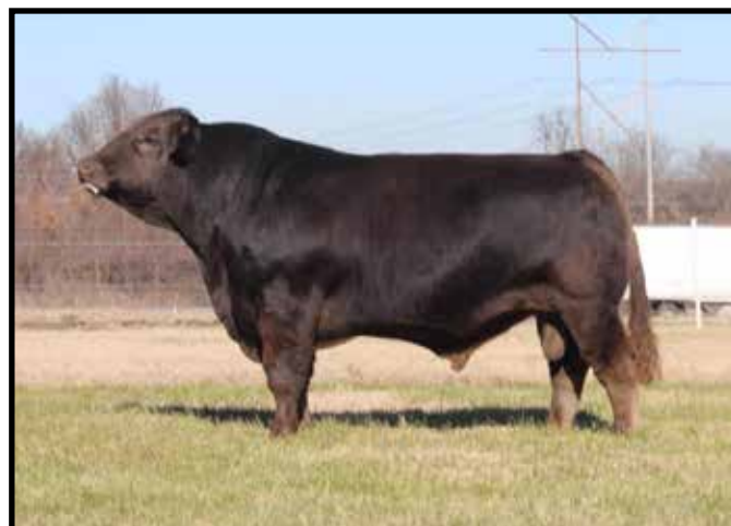
OCC MR BOJANGLES 152D ET