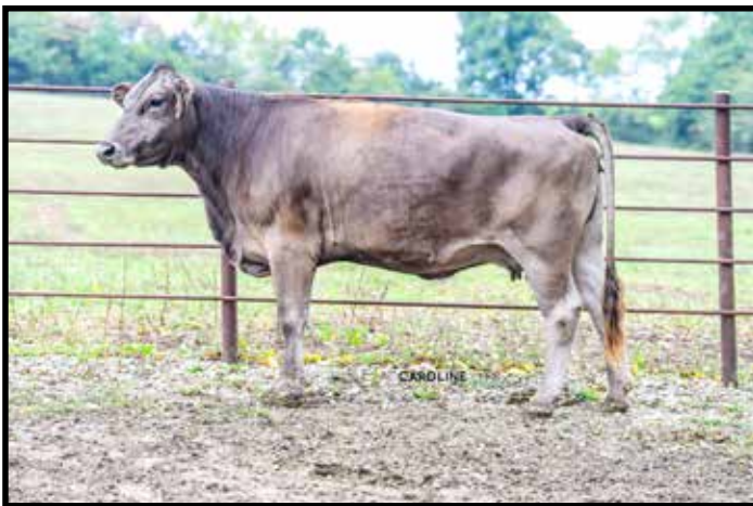
Lot 50 - PSC MISS FELICITY 1412