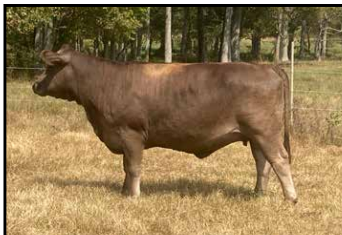
Lot 16 - WW MS 976G BP