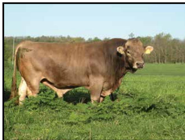
Mr. Bocephus Boy- sire of lots #1 & 2