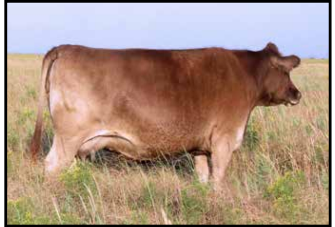
Lot 26 - BLC MARIA 454E