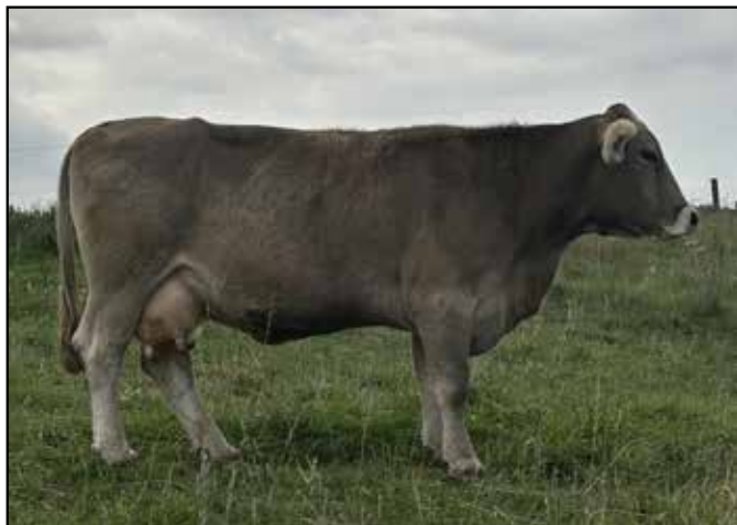
Lot 17 - CFARMS MISS 6733