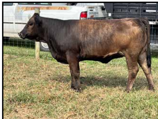
Lot 31 - TLC CANDY HEART 456BFK