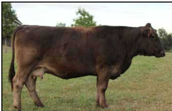
C FARMS MISS 2269 - Dam of Lot 21