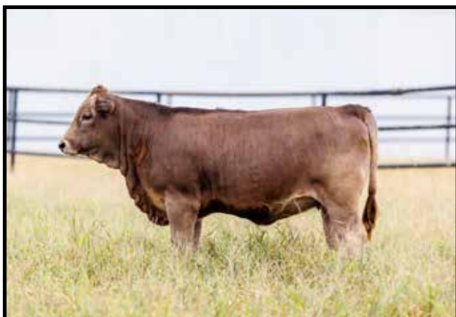
Lot 39 - MISS JMS TWINKLE L389