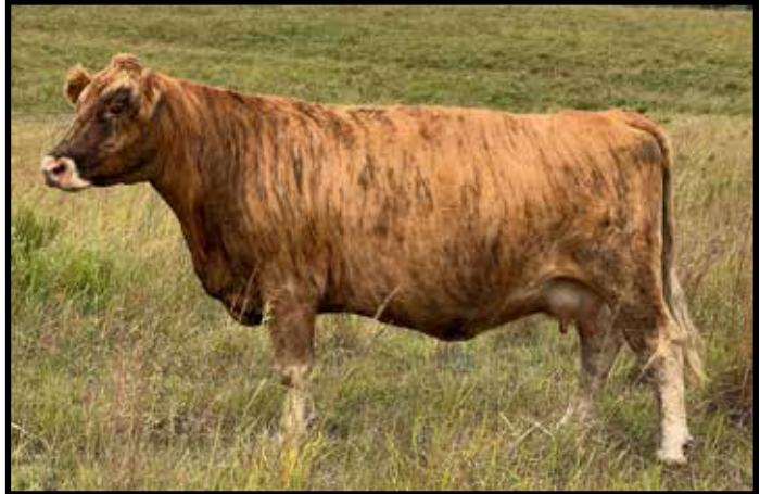
Lot 57 - WCCR SCARLET LADY 6127