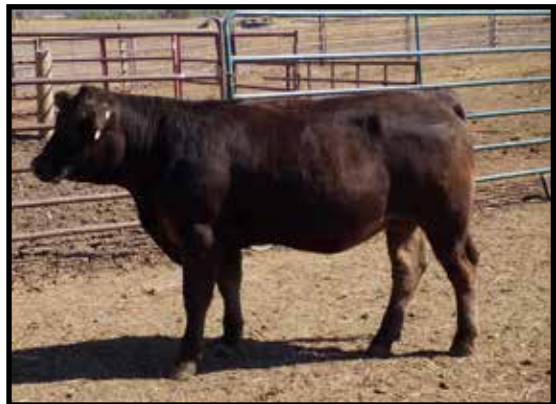
Lot 52 - MISS LHF DAYBREAK