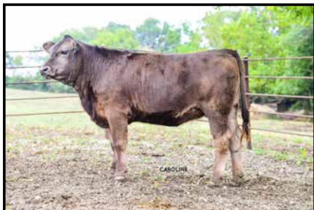
Lot 47 - GI MS STAR GAZER 6129 D532 2386