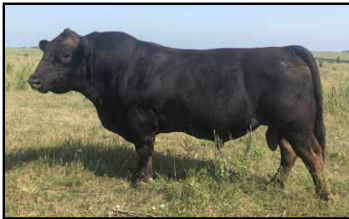
MR. HLJ PAYDAY D626