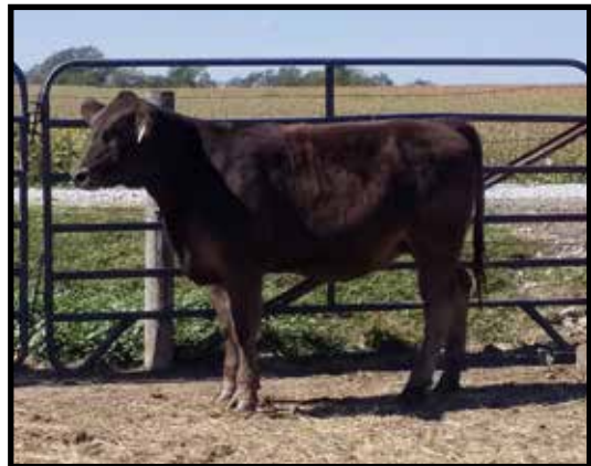
Lot 51 - MISS LHF EMMA