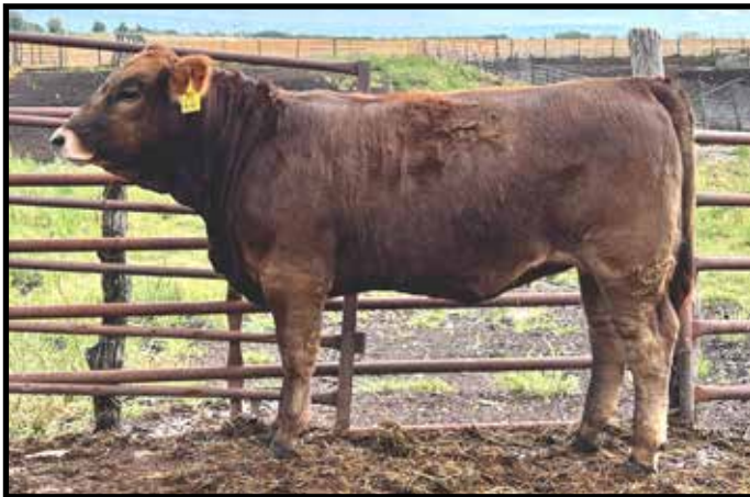
Lot 59 - WCCR HORIZON'S FOXIE ROXIE 2121