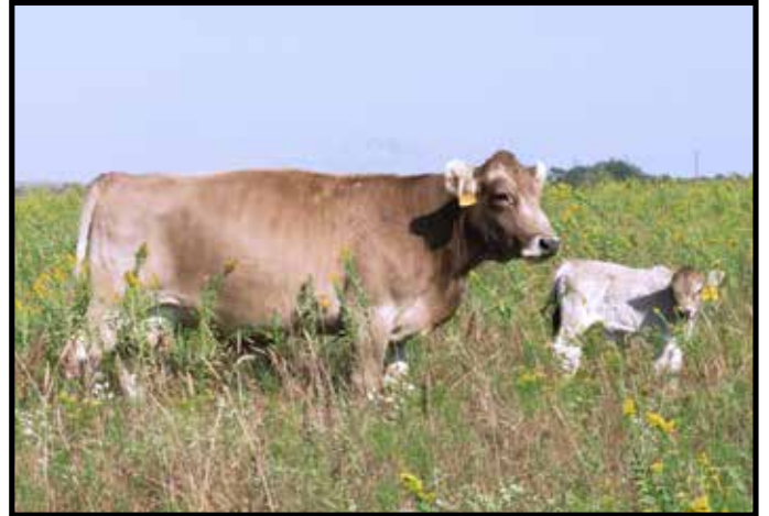
Lot 25 & 25A - BLC CAREFREE 284D