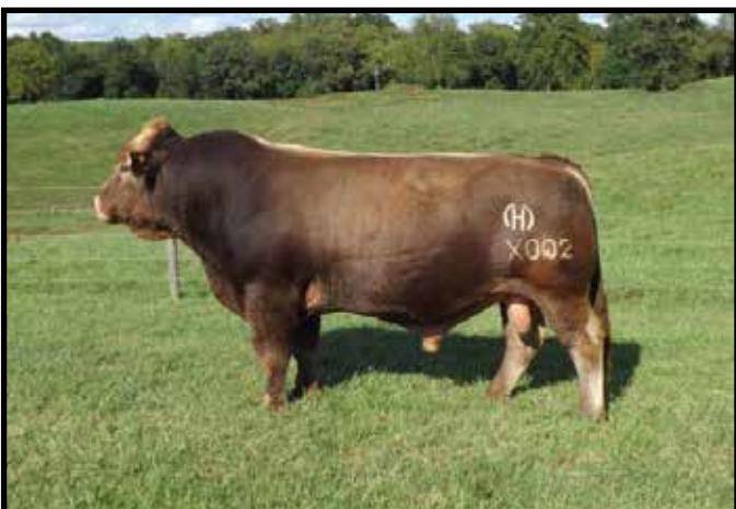
MHF XEROX X002- GREAT GRANDSIRE OF LOT 30