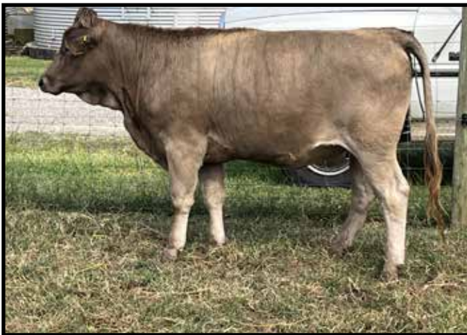
Lot 29 - BYB MS K04