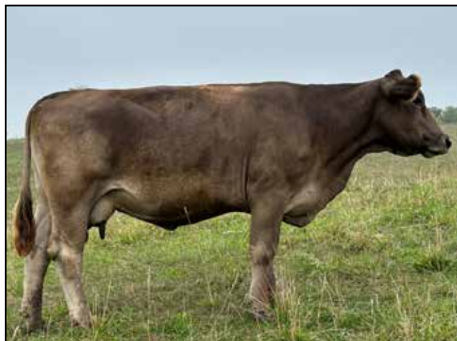
Lot 18 - CFARMS MISS 5322