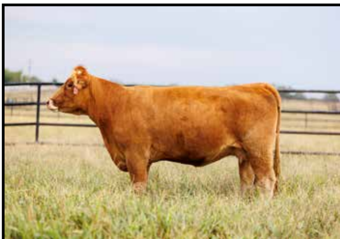
Lot 43 - MISS JMS REBA G137