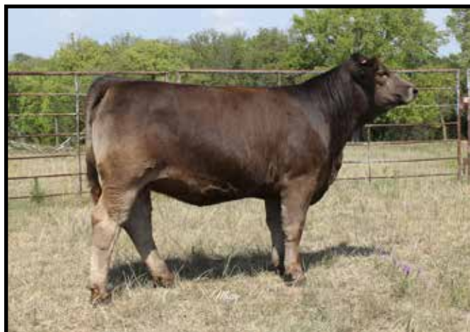
Lot 7 - MISS RCB K266