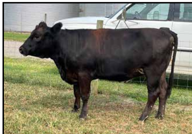
Lot 32 - MS RDF 1238K