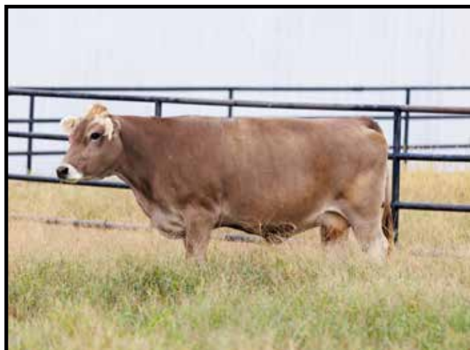
Lot 42 - LLB MISS D51