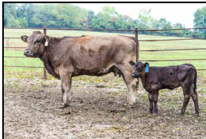
Lot 48 & 48A - GI MS SELENA 6203 D532 1170 & HEIFER CALF