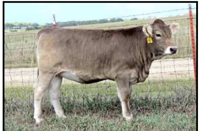
Lot 27 - BLC DAYDREAM 667L