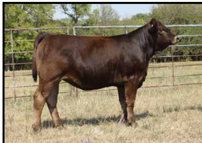
Lot 6 - MISS RCB K264