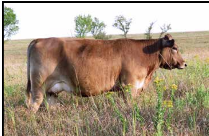
Lot 23 - BLC AURORA 287J