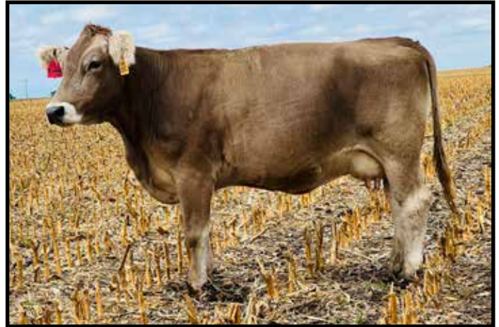
Lot 54 - EMMA LOU 08C