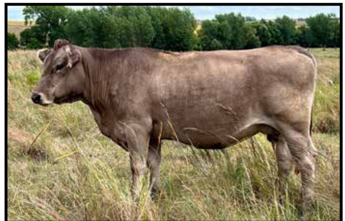
Lot 53 - WCCR GRACE 0064