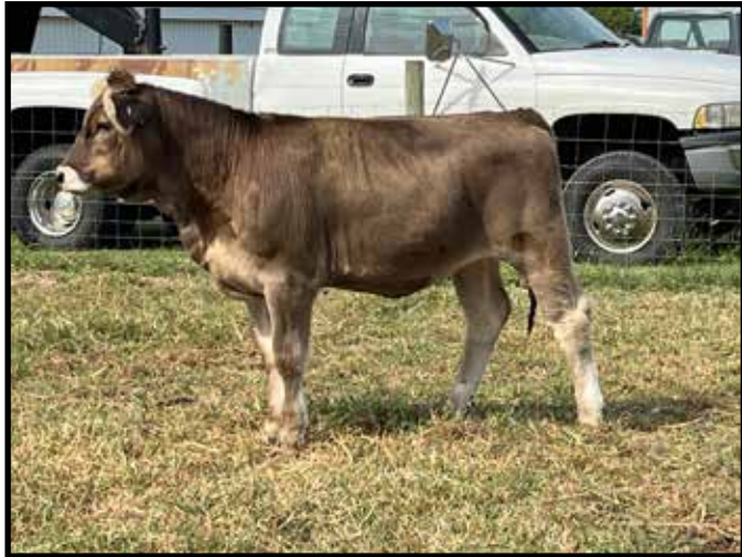
Lot 28 - MS RDF SUNNY 1297K