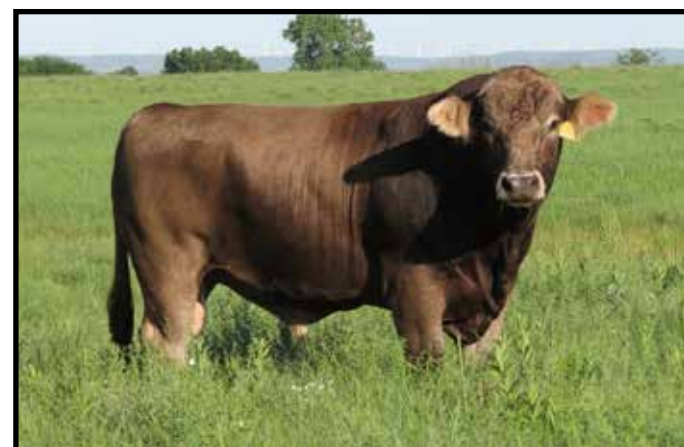
BLC EZ SLEEP 811G - Sire of lots 23A, 24 and 27. Grandsire of Lot 25A..