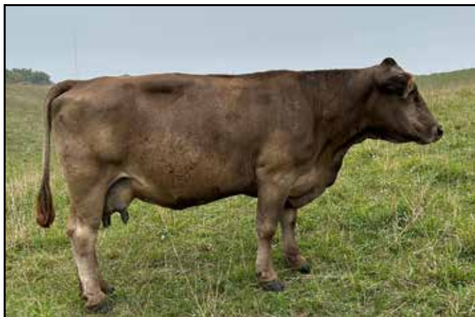
Lot 20 - CFARMS MISS 4384