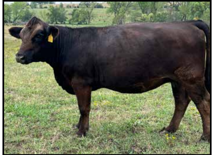
Lot 56 - WCCR STAR STRUCK 0116