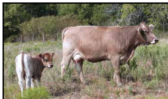
Lot 24 & 24A - BLC EZ DREAMER 883J