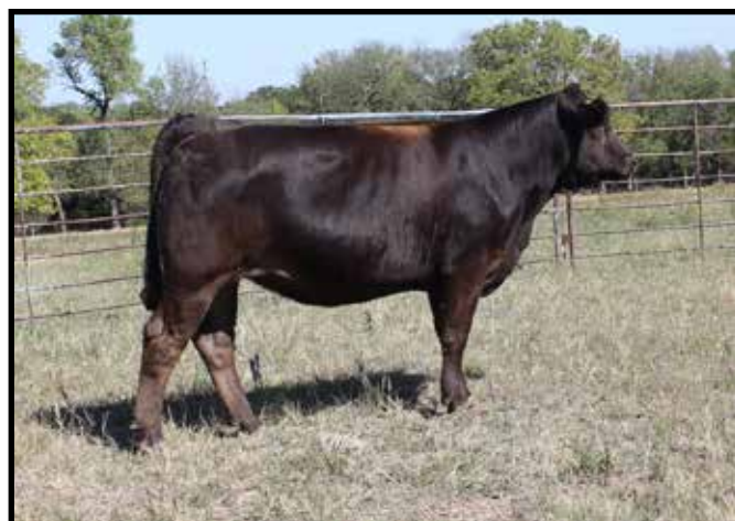
Lot 8 - MISS RCB J170