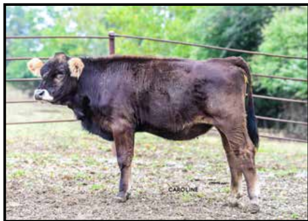
Lot 45 - MISS RCB K260