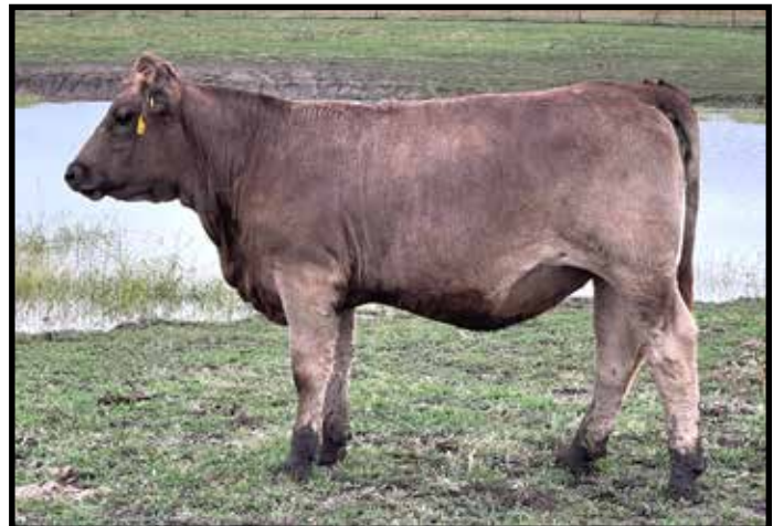
Lot 58 - WCCR PATRIOT'S QUEEN 2104