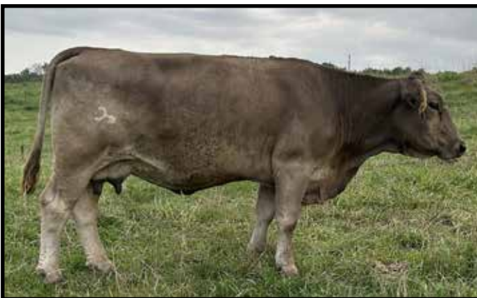
Lot 22 - CFARMS MISS 4383