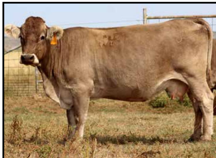
Lot 41 - ALEXANDER LONESTAR LAUREL

See Video Links and the Supplement Sheet with updated sale information at: www.brinkbraunvieh.com