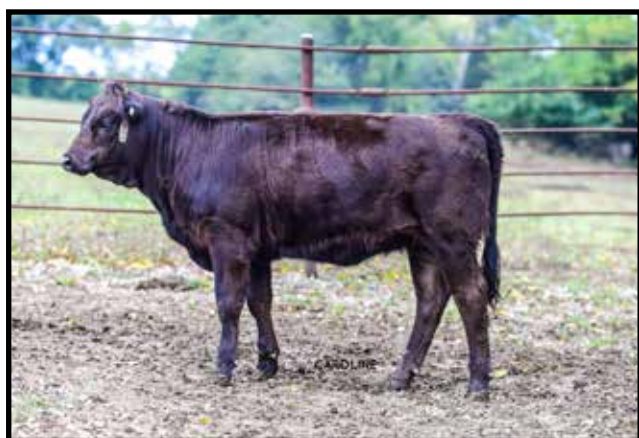
Lot 46 - GI MS GEORGIA 7688 0954 3400