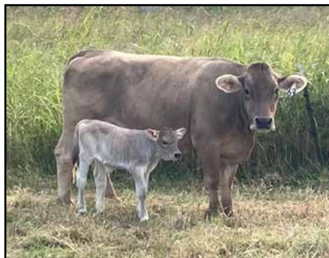
Lot 14 & 14A - LLB MISS 71F