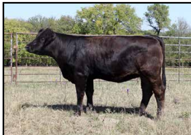
Lot 9 - MISS RCB J172