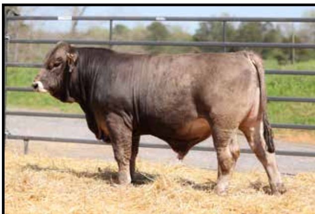
RDF POLAR BEAR 1232K