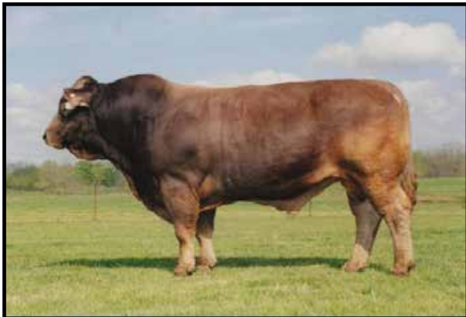
SILVERWOOD DRAGON 4Y