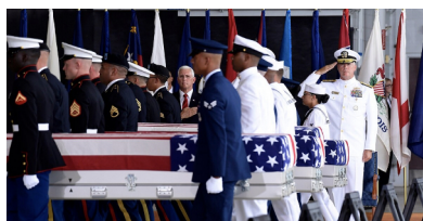
Military members carry transfer cases at a ceremony marking the arrival of remains believed to American service members who fell in Korea.