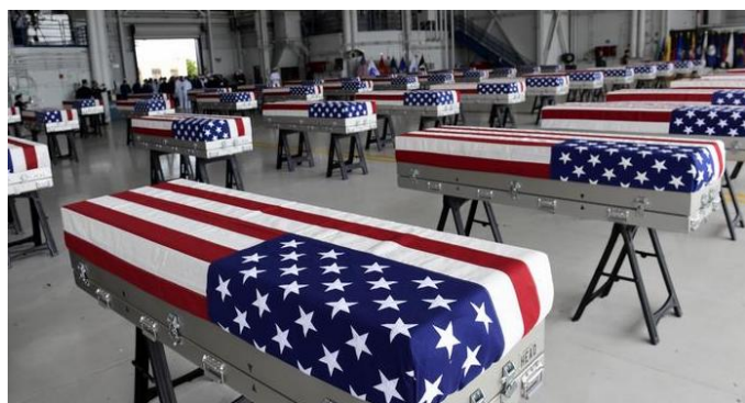
Defense POW/MIA Accounting officials conduct an honorable carry ceremony at Joint Base Pearl Harbor-Hickam for the 55 cases believed to contain the remains of American service members lost in the Korean War.