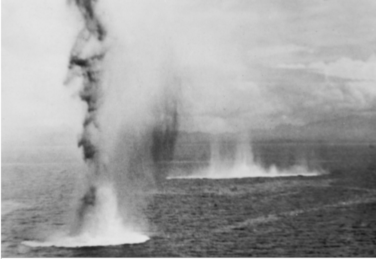
Bombs hit the waters of Savo Island in the wake of a cruiser during the Battle of Savo Island.

The USS Astoria provided fire support and air cover during the invasion of Guadalcanal supporting the Marines as they landed on Guadalcanal and several smaller islands nearby.