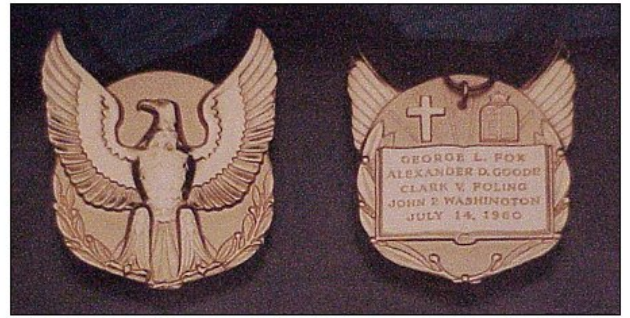
Presented posthumously to the Four Chaplains

"Not for my safe return, that wouldn't be fair. Just pray that I shall do my duty.... Never be a coward... and have the strength, courage and understanding of men.