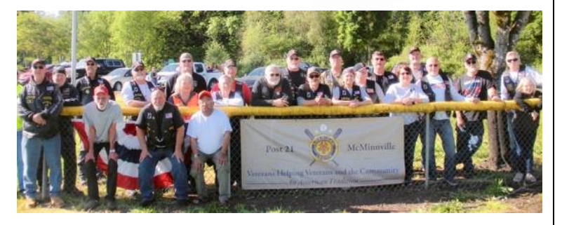
Legion Family supporting Youth Baseball on opening Day 2019