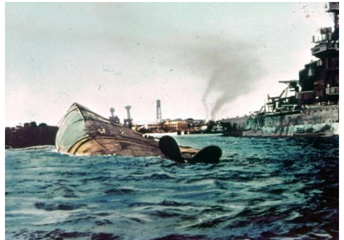
USS OKLAHOMA Floats capsized near the USS Maryland December 7, 1941.

In 2015, as part of the USS Oklahoma Project, the Defense POW/MIA Accounting Agency, through a partnership with the Department of Veterans Affairs, exhumed all of the unknown remains from the USS Oklahoma , and began the lengthy identification process. As of March 2018, DPAA made their 200th identification from the ship’s casualties.