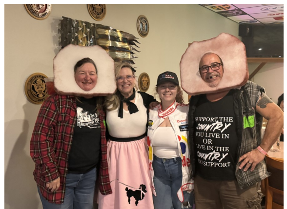
Costume Contest Top 5: From left: Sandy, Purple Witch, Ricky Bobby, In-Bred Family and Freddy Kruger