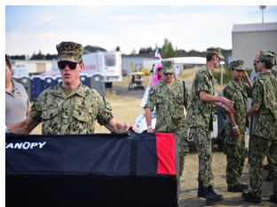
The cadets provided some much needed muscle during set up