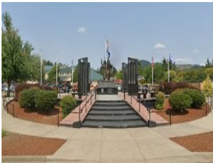
Grand Ronde, Oregon Veteran Memorial