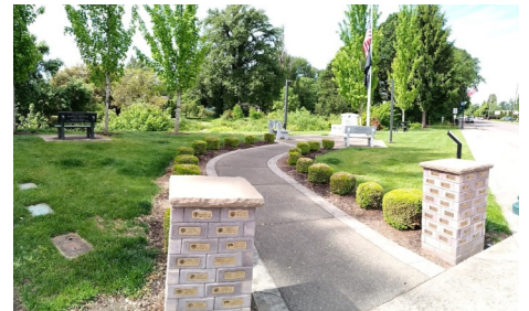
Sheridan, Oregon Veteran Park