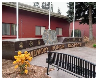
Dayton, Oregon Veteran Memorial