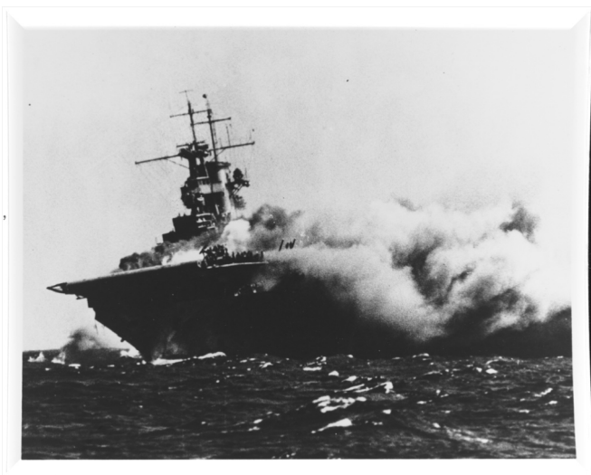
The U.S. aircraft carrier USS Wasp (CV-7) burning after receiving three torpedo hits from a Japanese submarine.

On her final voyage, Wasp was under way in the Coral Sea, escorting transports carrying the Seventh Marine Regiment to reinforce U.S. troops on Guadalcanal, where Japanese forces were pushing back against American efforts to seize the Solomon Islands. On September 15, 1942, she encountered the Japanese submarine I-19 , which launched a spread of six torpedoes. Japanese torpedoes of that era ran just below the surface and had large explosive warheads that detonated on contact with their target. Three struck the Wasp and multiple explosions ripped through the flight deck forward as her ammunition magazines and aviation gas stores caught fire and began to consume the ship from the inside out. Fuel and gas spilled into the water, creating a burning pool on the surface.