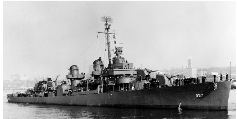
USS JOHNSTON – DD-557