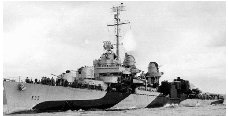
USS HOEL – DD-533