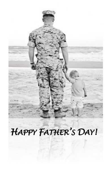
We're on the Web! Visit us at: Vetsclub21.org

Non-Profit U.S. Postage PAID McMinnville, OR Permit No. 27