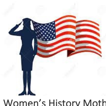
Women's History Moth

March is Women's History Month and well over 200,000 women serve on active duty in the U.S. military. The contributions of women to military history (and well beyond) cannot be ignored. While Women's History Month isn't a time to focus exclusively on the contributions of women in military service, the contributions of female veterans are certainly an important part of American history.