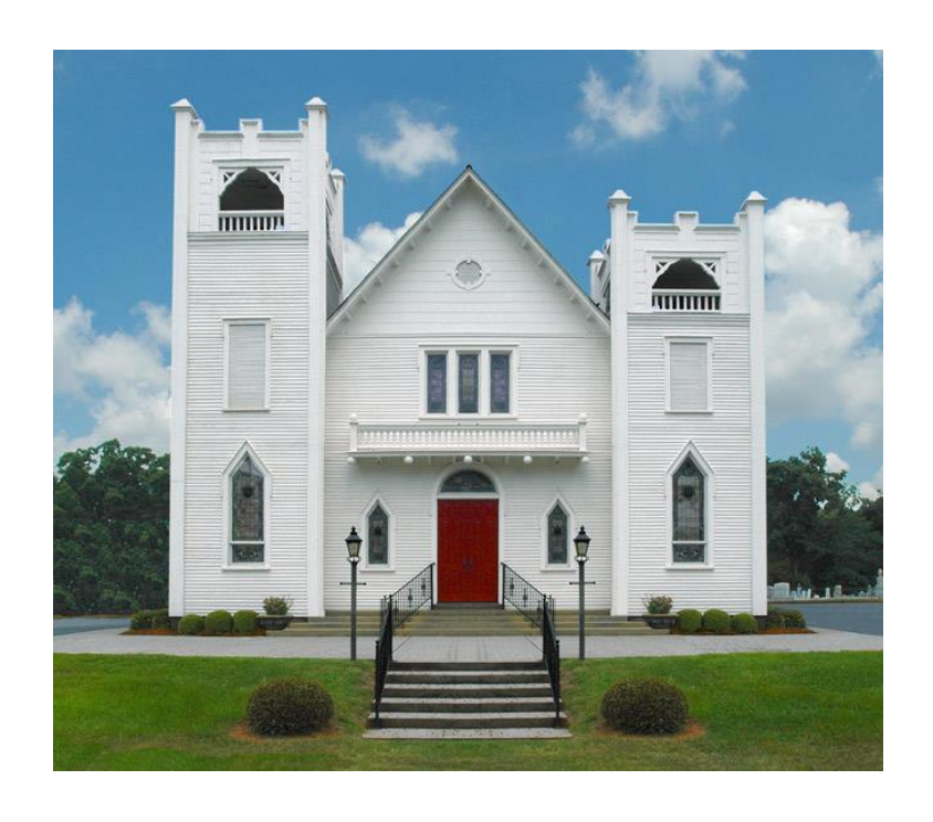
Fifth Sunday After Pentecost