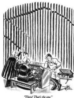
"There! That's the one."