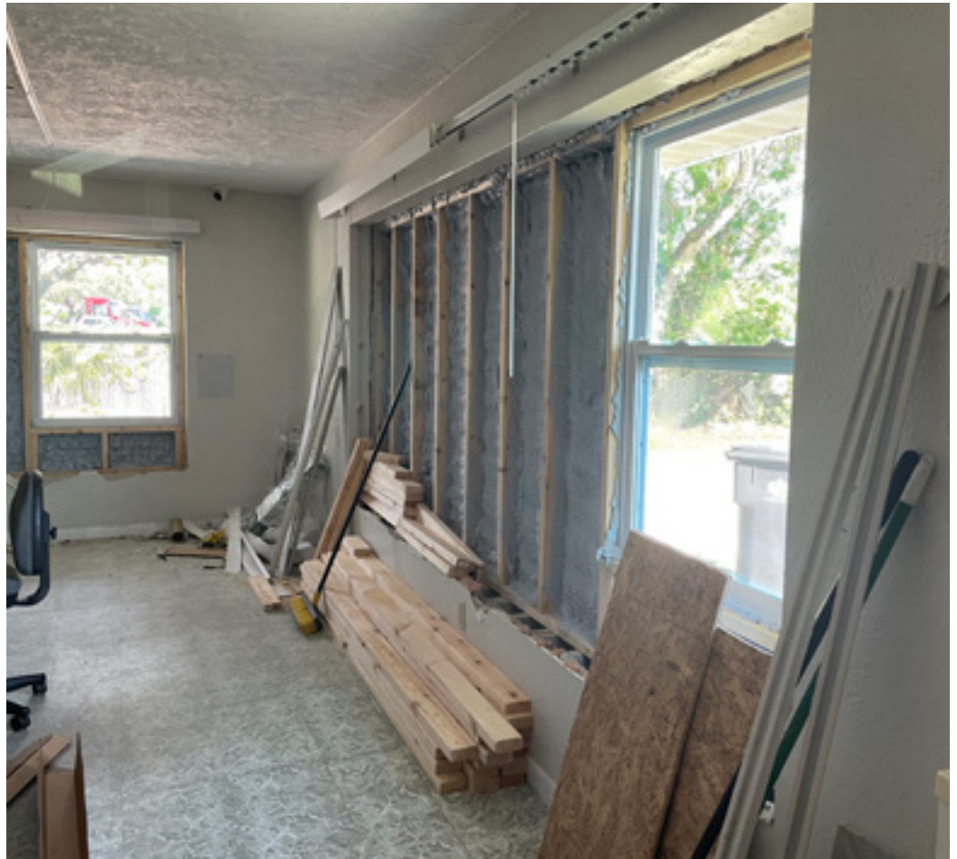
Work is progressing in the faceting area.