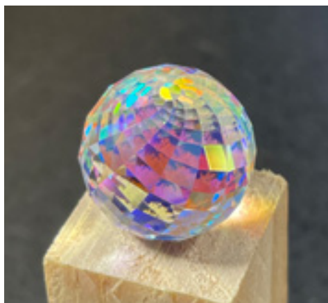
Lyra's faceted sphere (X-Cube) tied for first in the synthetic category of the Prettiest Stone Contest.