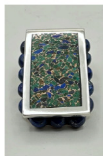
Pendant 3 with side inlay