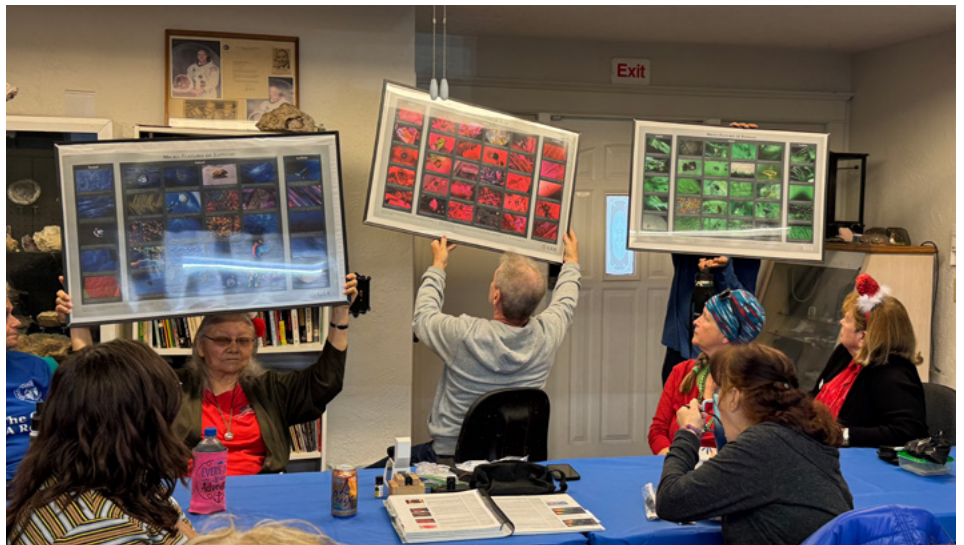
Posters depict what gemologists look for when evaluating a stone.