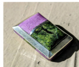
Pendant 4 with side inlay

Students will construct an Inlay Pendant — two of pendant No. 1 and/or No. 2, or one of pendant No. 3 or No. 4 — using sterling silver sheet, square or triangle wire with hard solder and Prip's flux. For pendant 3 or 4, add side inlay design detail and top inlay stone. Students can bring basic silver tools (favorite jeweler's saw, forging hammer, rawhide, etc.), pocket knife or scribe, though all tools needed will be available to use. Students need to bring a slab or four pieces of tumbled rock to inlay. Bring something that calls you or is exceptional, it makes the pendant. Pattern stones do very well with plain colored stone. There will be rock available, but most people usually have something that is special already. Lunch will be provided by the club.