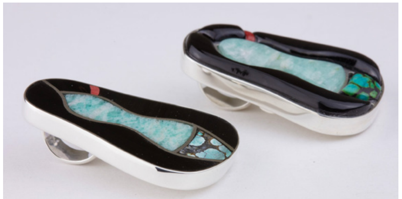
Flush inlay, left, cobblestone inlay, right.