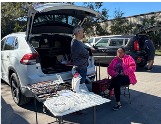
Members mingle at the tailgate.