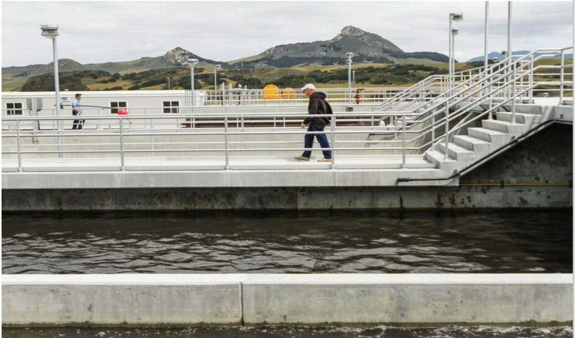
Visitors tour the Los Osos wastewater facility when it first opened in 2016.