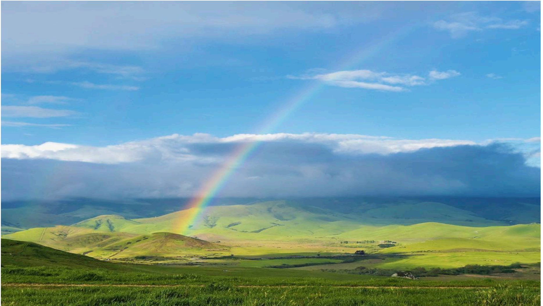
A rainbow arches over green hills near Los Osos on April 14, 2024.