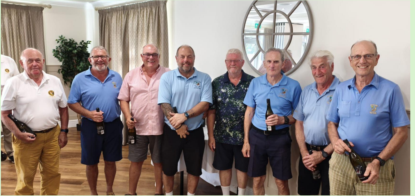
Ryston Park GC team, second place