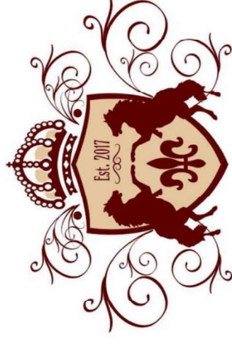
Above The Standard Show Series