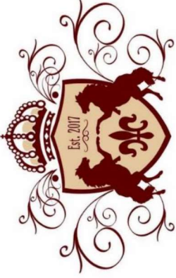
Above The Standard Show Series