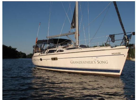
On the hook