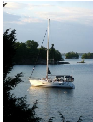
On the hook II