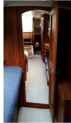
Looking Aft from Guest cabin