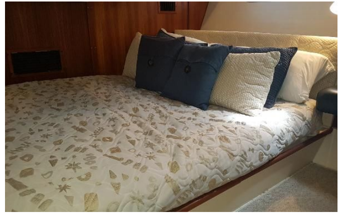
Custom bedding Owner's