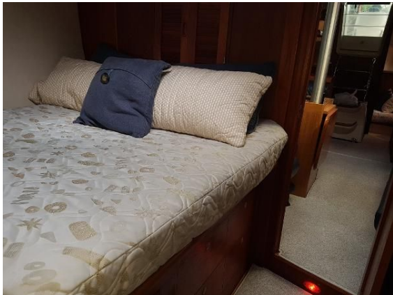
Custom Bedding Guest Cabin