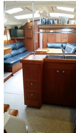
Looking forward - Very Bright and airy below