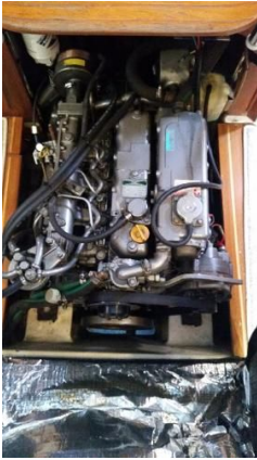
54HP with Balmar Highout put alternator