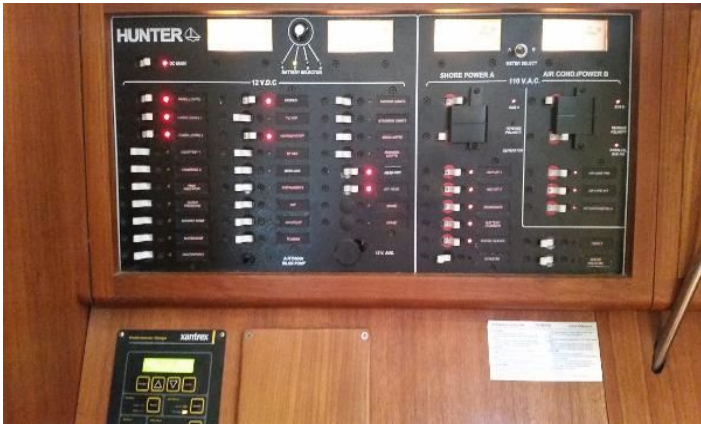
110 and 12V panels