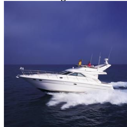
400 Sedan Bridge