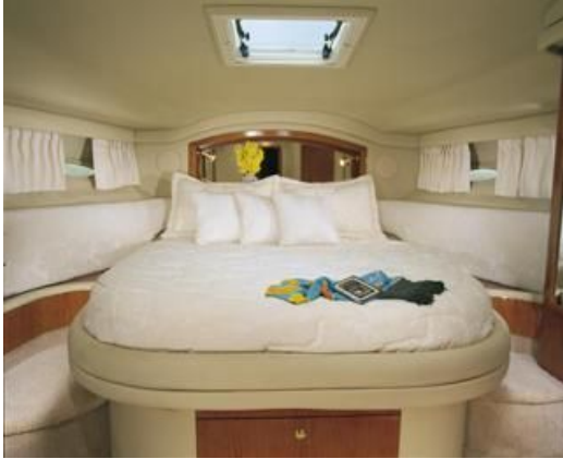
400 - cabin