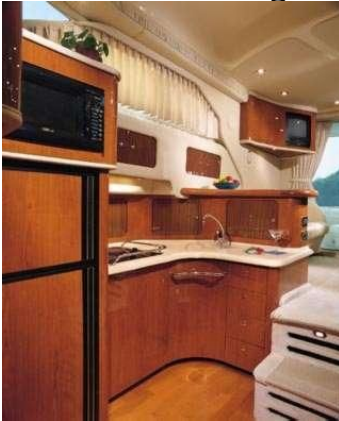
Manufacturer Provided Image: 400 - cabin