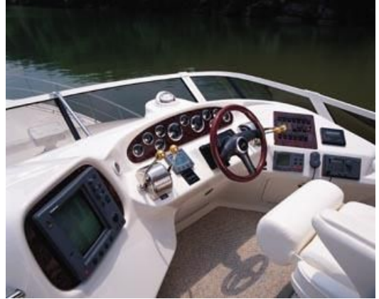
Manufacturer Provided Image: 400 - helm