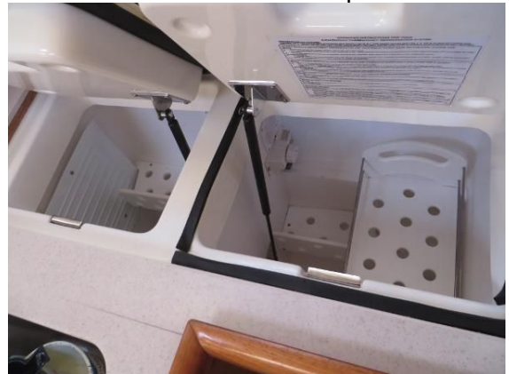
Massive fridge and freezer