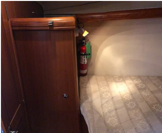
V Berth storage II Port side