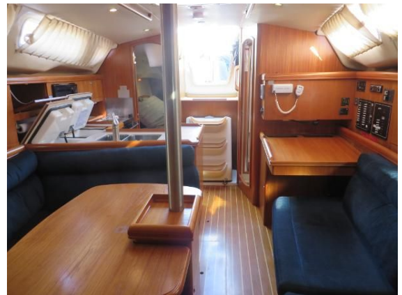
Salon looking aft