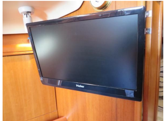
Flat Screen TV