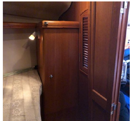
V berth storage Stb