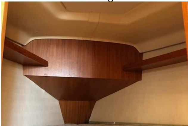
Vee Berth Head liner area