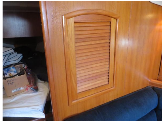
ability to open up the cabin and also allows air movement