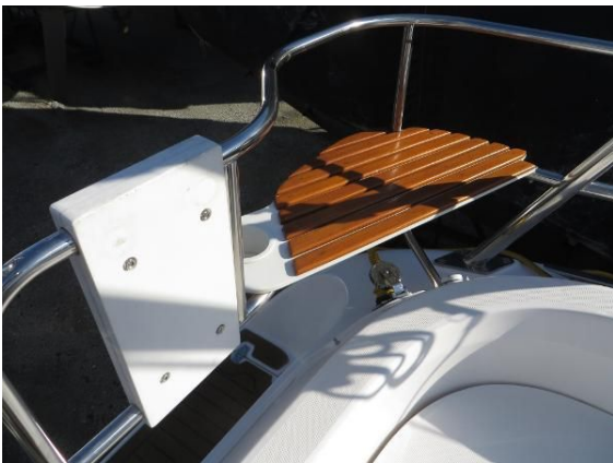
OB motor storage