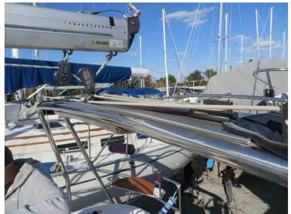
Traveller on arch