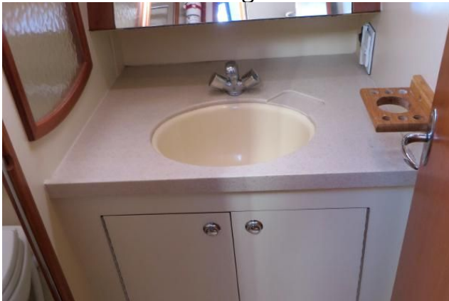
Vanity in Head