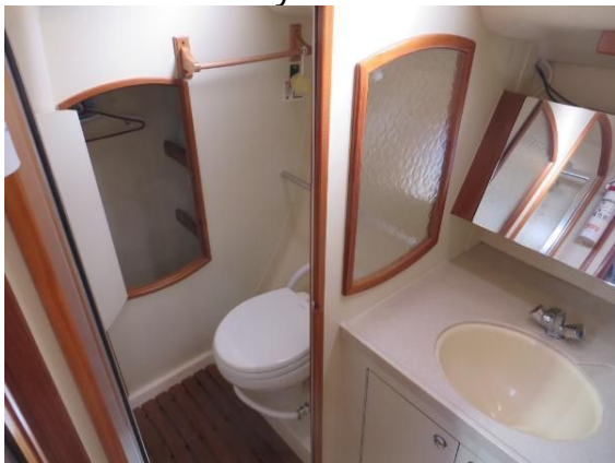
Head / Shower / Wet Locker