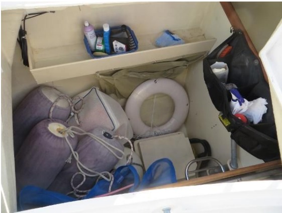
Massive storage in cockpit