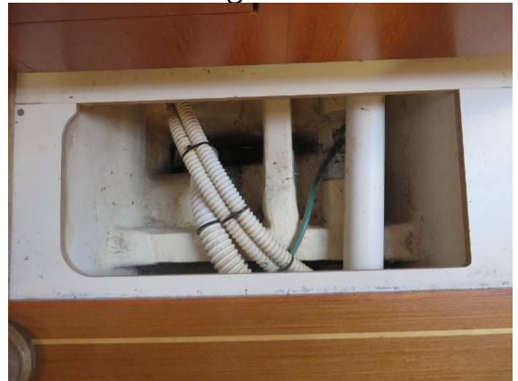
Bilge area II