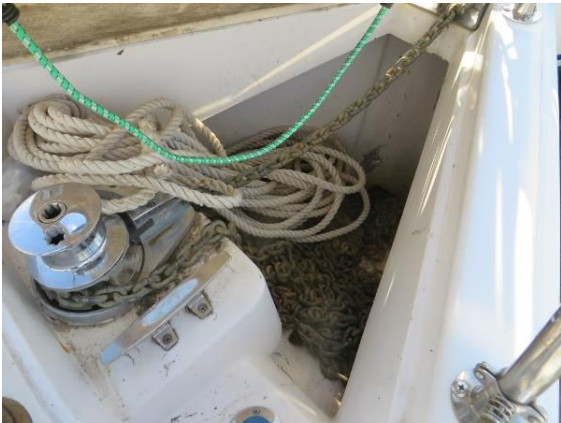
Anchor Locker windlass