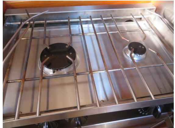
Clean Stove Top