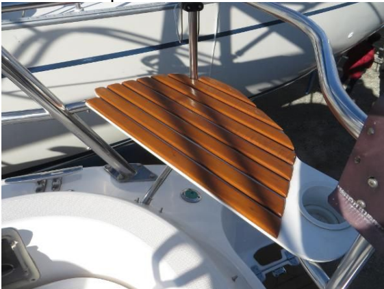
Taft Rail Seat I