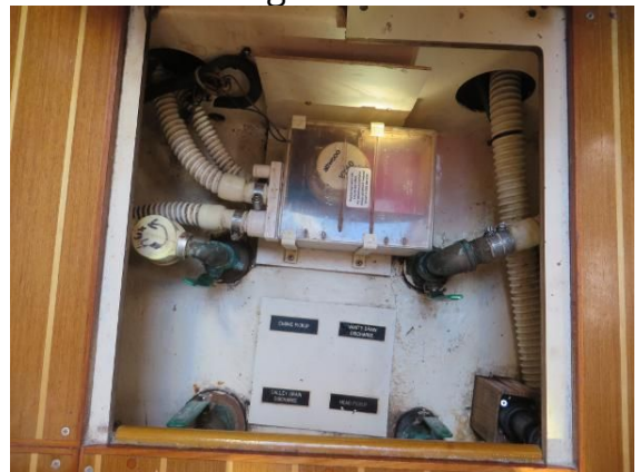
Thru Hull location