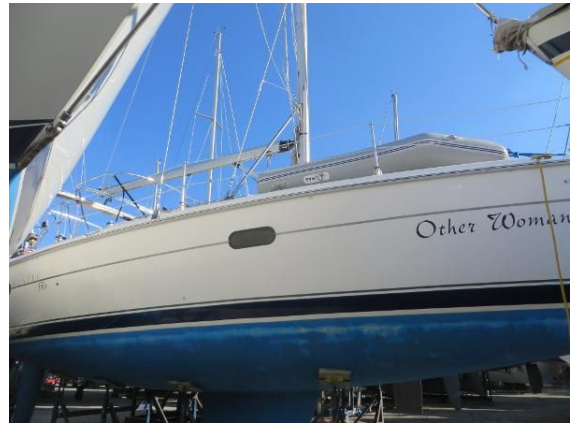
Top side II