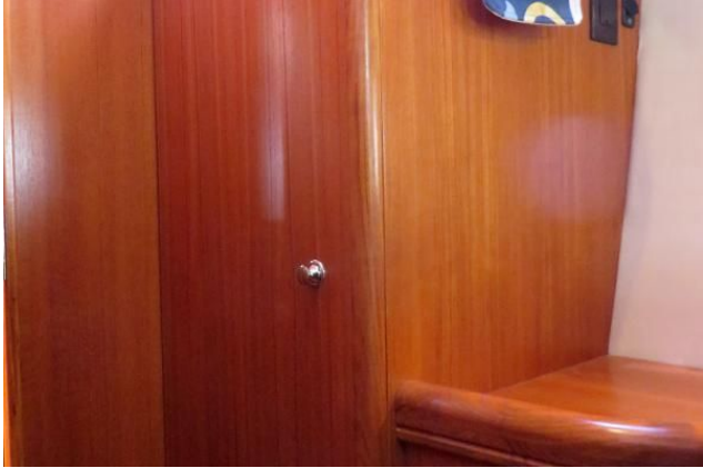
Storage at the headboard, along stern and under berth