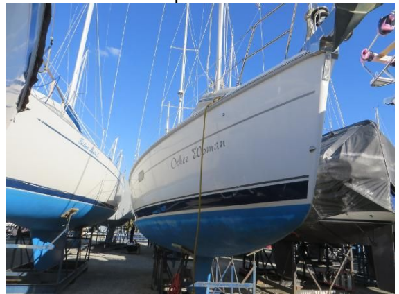
Top side III